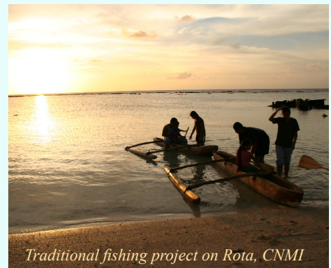
Traditional fishing project on Rota, CNMI

In FY 2008, PIRO Grants Program processed 36 awards totaling over $13million to recipients from Hawaii, Commonwealth of the Northern Mariana Islands, Guam, American Samoa, and the continental United States for fisheries research, management and conservation.