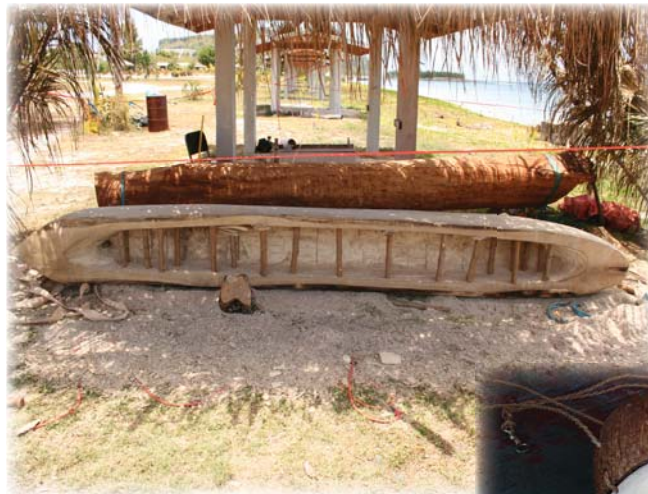
Traditional canoes are carved for a fishing education project on Rota (left). Instructors teach local students traditional fishing methods using canoes and drop stone. The drop stone or poio is made of coconut shell, coral and hibiscus fibers (below).

For more details see the new PIRO grants website, Grants Online information page.