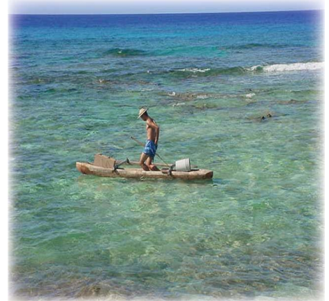
Rota fishing instructors in a training session use the canoe and special fishing tools to catch fish like achuman, opelu, mackerel scad (above).

Congratulations, you have successfully submitted your report!