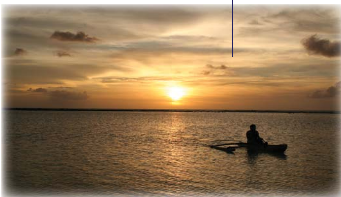
The sun sets as a traditional fisherman from Rota heads home with his catch for the day. Currently on Rota, there are only 30-40 active fishermen providing seafood products for the Rota community.

The Northern Mariana College, Rota campus is assisting local communities to restore the traditional fishing knowledge and skills of Hachuman. The Hachuman technique is a traditional method where local fishermen train fish (achuman, opelu, mackerel scad) to rise to the surface. Practitioners fish from a canoe using a drop stone and shredded coconut to aggregate the fish at the desired depth. The goal of the project is educate Rota's youth in the restoration of traditional practices to fulfill the seafood demand of local consumers while improving economic development.