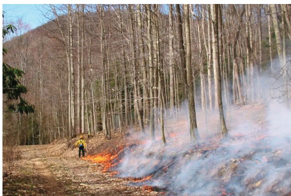
Scientists are using the Fernow to study the effects of prescribed fire on forest regeneration and wildlife habitat.

Research results from the Fernow are conveyed in many ways, including more than 1,200 scientific journal articles and government publications, presentations at conferences for land managers and other scientists, field trips, videos, web presentations, workshops, and class room instruction. The original demonstration objective of the Fernow is alive and well, and many guided tours of the Experimental Forest are provided each year to students, resource professionals, policy makers, and landowners. Regularly updated signage along the Fernow roads also shares information about experiments to area visitors.