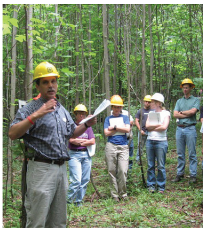
Guided field trips of the Fernow provide an effective way for groups to learn more about forest research and management.