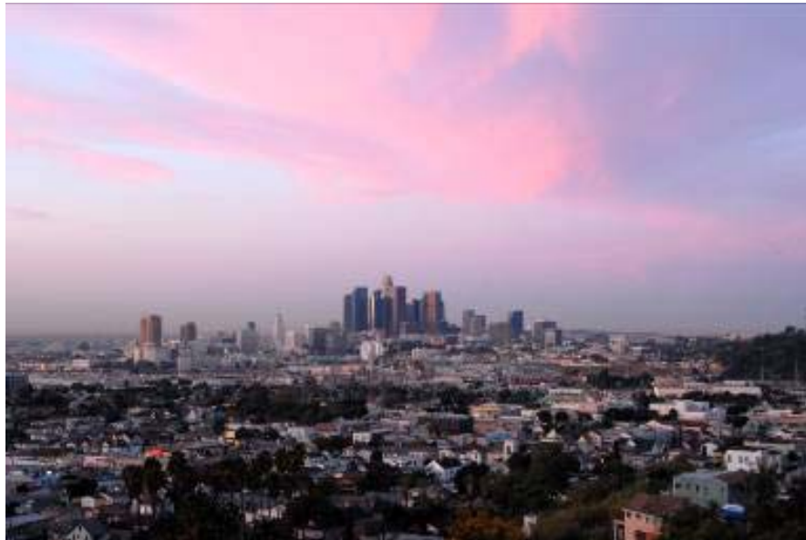
Figure 1: The City of Los Angeles