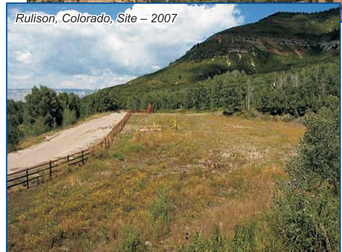
Rulison, Colorado, Site – 2007

one-trillionth of a unit. Rainwater contains about 25 picocuries of tritium per liter.