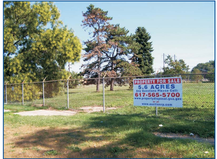
The former New Brunswick Laboratory site located in New Brunswick, New Jersey, was sold to a private buyer via an online auction.

Before the site could be transferred to a public agency or sold to the general public, NJDEP required additional ground water and soil testing. Test results found elevated levels of arsenic in one soil sample. NJDEP found that site ground water quality was acceptable.