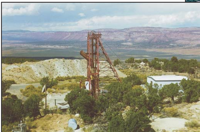
C-JD-5 Mine (active)

A link to the PEA and FONSI documents can be found on the DOE-LM website at http://www.LM.doe.gov/land/sites/uranium_leasing/uranium_leasing.htm . Hard copies (paper version or CD) of the documents can be requested by calling 1-800-399-5618.