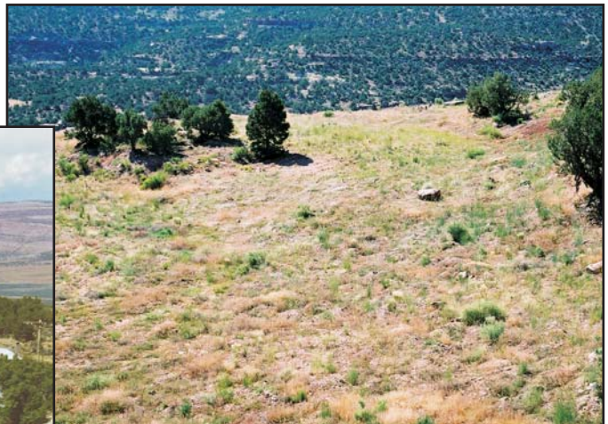
C-CM-25 Mine (reclaimed)