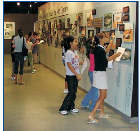
The Hollenbeck Middle School Science Club Tours the Weldon Spring Interpretive Center.

The Weldon Spring Site Interpretive Center will continue to provide the community with pertinent information about the site. Public response to site activities has been very positive and LM feels that this type of feedback is essential to ensuring long-term understanding of the site mission.