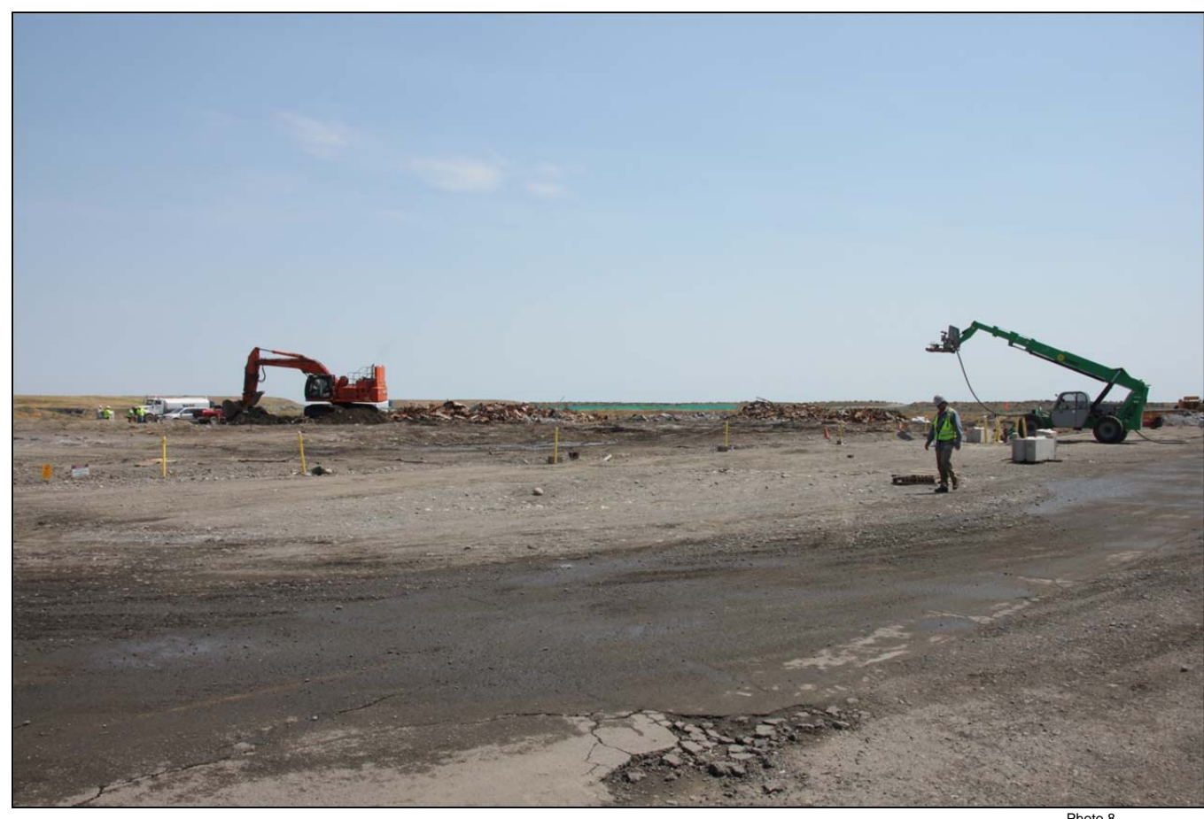
All five boilers have now been lowered at the 284-E Power House, and debris cleanup at the site of the March 4 explosive demolitions of 284-E's stacks and baghouses – and the subsequent demolition of the main building – is nearly complete.