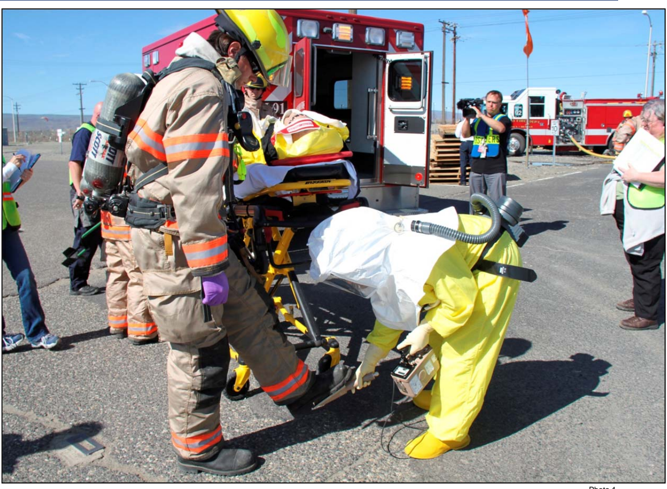
Members of the Hanford Fire Department are surveyed before transporting a simulated victim from PFP during the Regional Emergency Exercise held at Hanford on June 16, 2011.