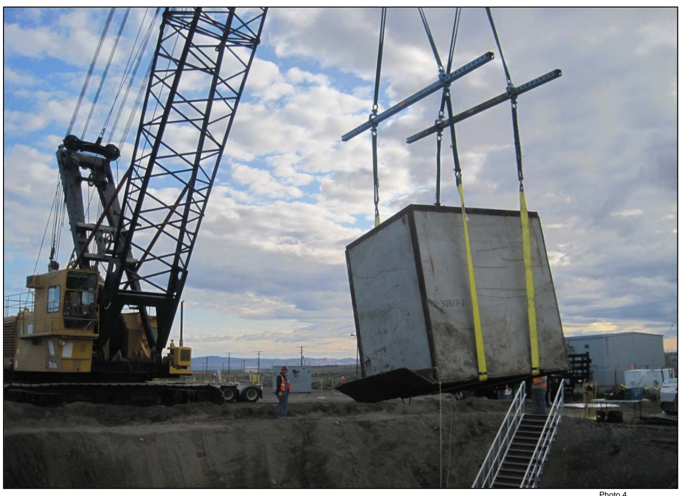
A large concrete box, Box 105, is removed by crane from Trench 11 of the 4B burial ground. The skid plate is visible to allow the box to be dragged into the trench when it was buried in 1970.