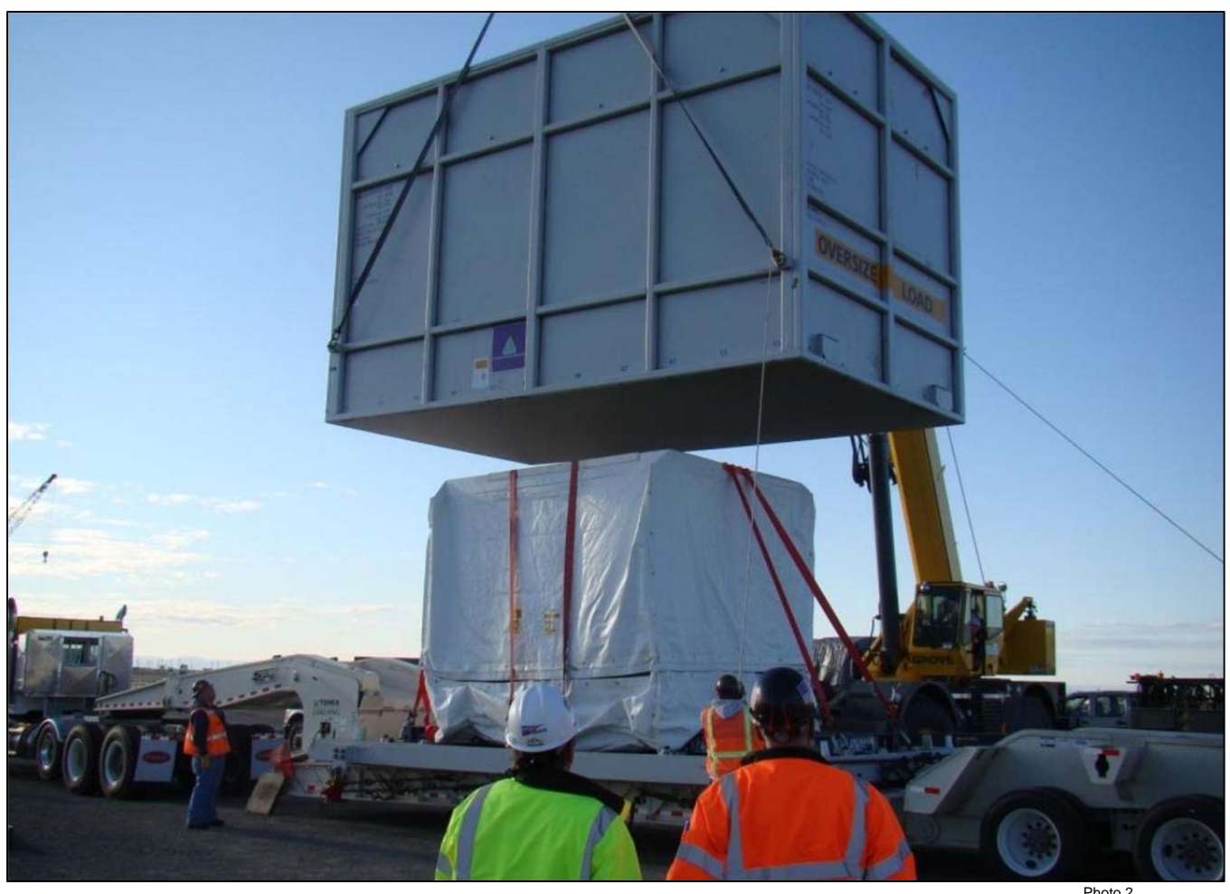
Workers load a large box of transuranic (TRU) debris from the Waste Retrieval Project onto the Super 7A shipping container and replace the top cover. The TRU waste will be shipped to Perma-Fix Northwest for repackaging into standard waste boxes and returned to the Hanford Site.