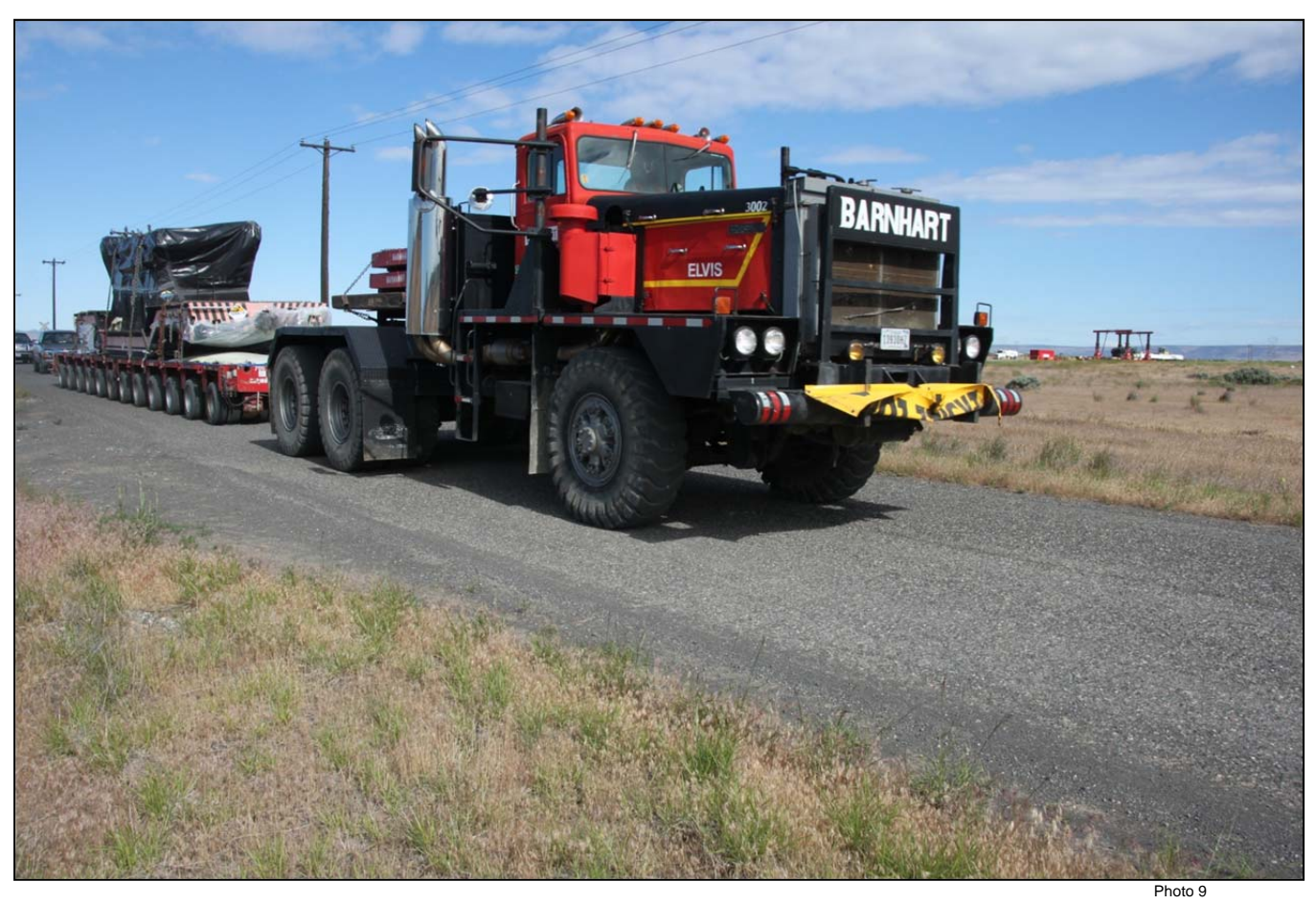
CHPRC subcontractor Barnhart Crane delivers the fourth of the cask well cars to the Environmental Resoration Disposal Facility (ERDF). One tall and one standard cask well car will be delivered to B Reactor to join the two locomotives for preservation and display; the rest will be delivered to ERDF for disposal.

CHPRC crews and subcontractors Clauss Construction and Barnhart Crane delivered the fourth of the cask well railcars to the Environmental Restoration Disposal Facility (ERDF).