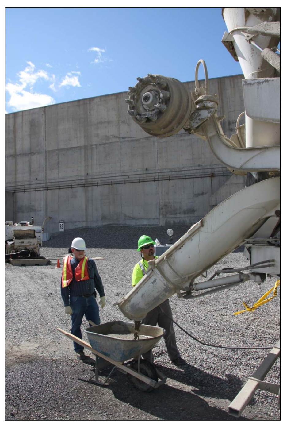
CHPRC subcontractors pumping grout into U Canyon fill up a wheelbarrow for a quality-control test.

CHPRC crews continued pouring grout into U Canyon cells, delivering approximately 300 cubic yards of grout into Cells 1-16. Workers also continued preparations to remove the D-10 Tank from Cell 30, wrapping the shipping cask with additional lead and tungsten shielding and hoisting the cask onto the truck that will carry D-10 out of the canyon.