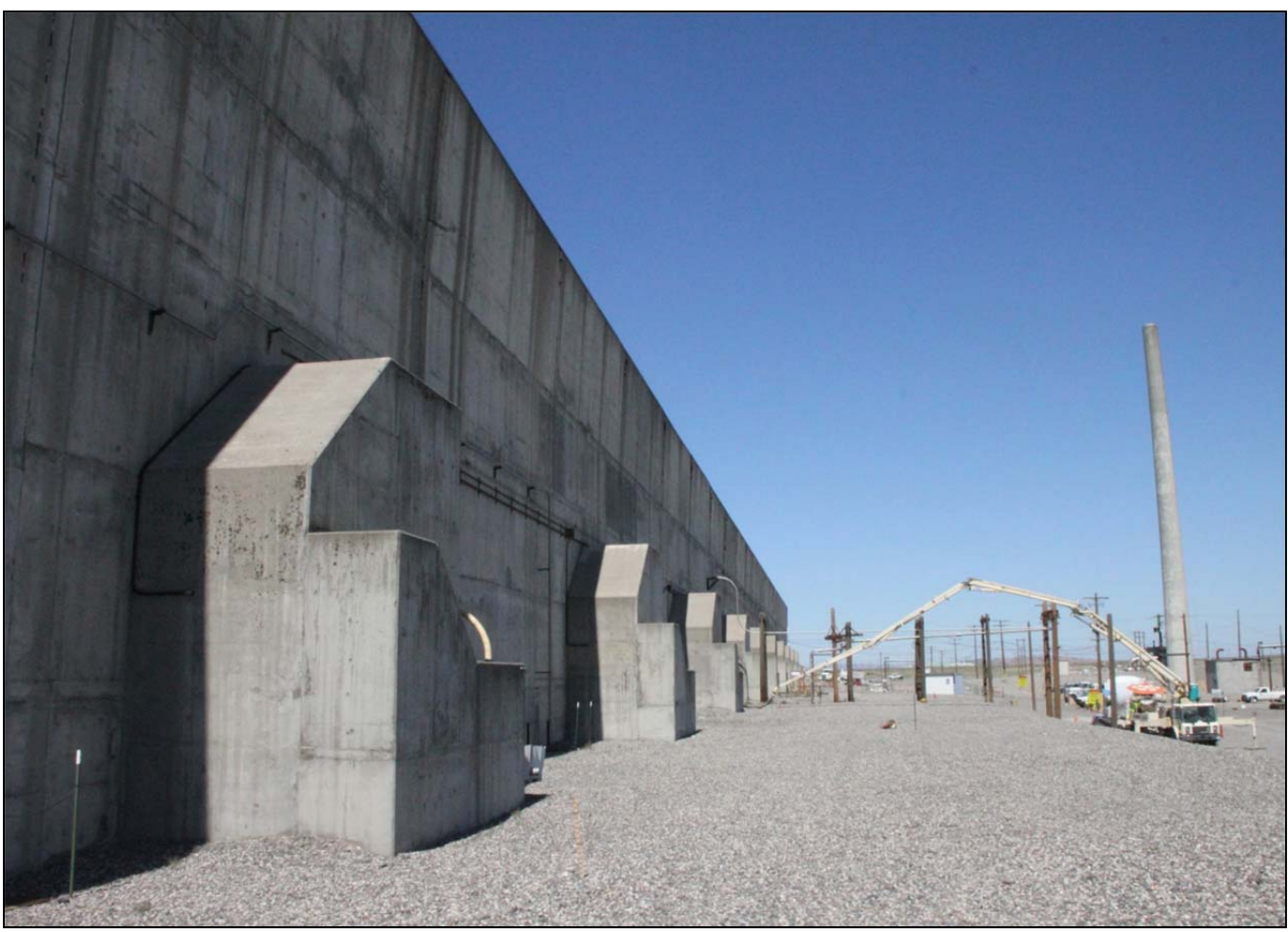
CHPRC continues to fill U Canyon cells with grout, with another1,010 cubic yards of grout poured for a total of 5,109 cubic yards of a planned 20,318 – approximately 25 percent.