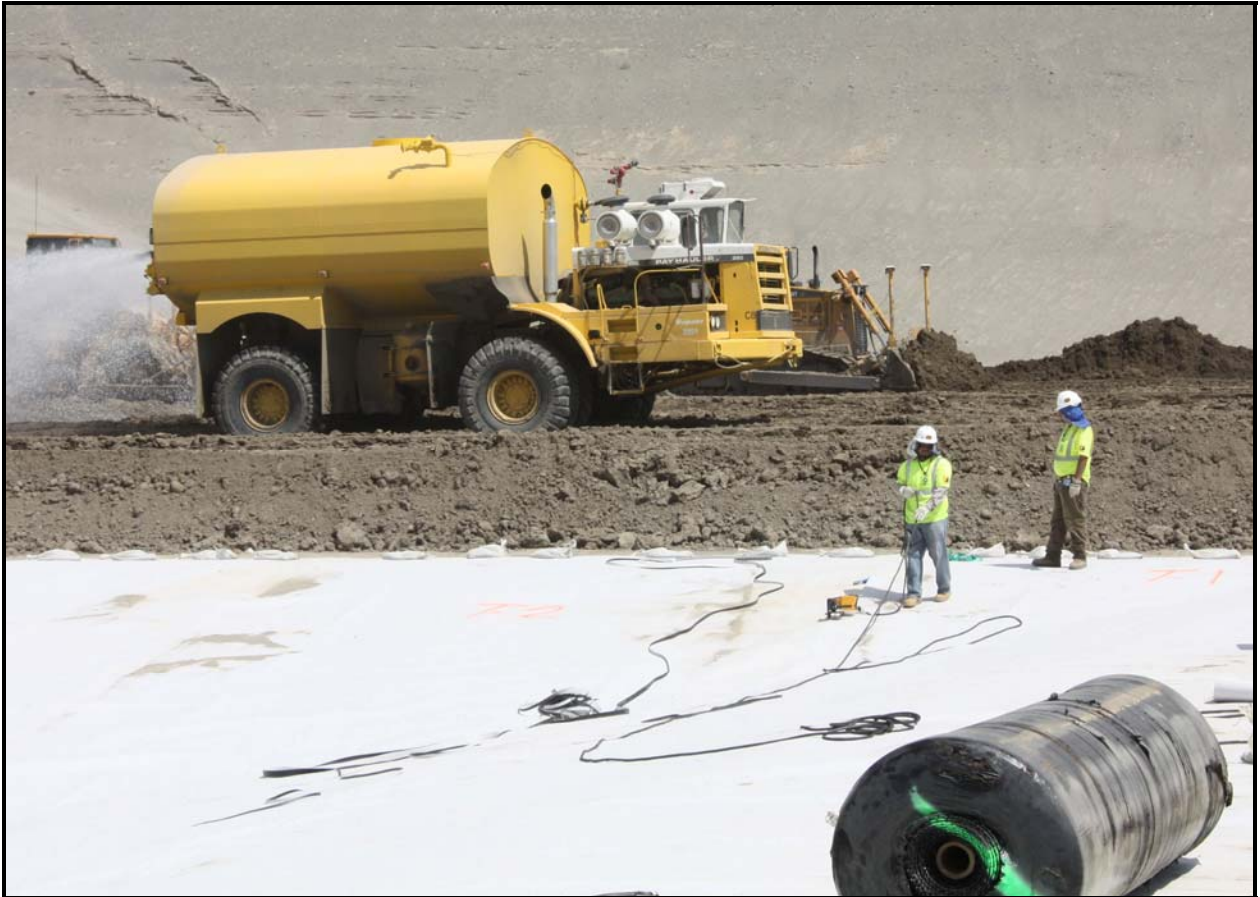
Workers continue to install the primary high-density polyethylene liner in super cell 9 while admix is being placed in super cell 10 at the Environmental Restoration Disposal Facility.

The installation of the HDPE and geocomposite liners in super cell 9 also continues at a rapid pace. More than 90% of the secondary HDPE liner and 65% of the primary HDPE liner has been installed. The geocomposite liner is 70% complete.