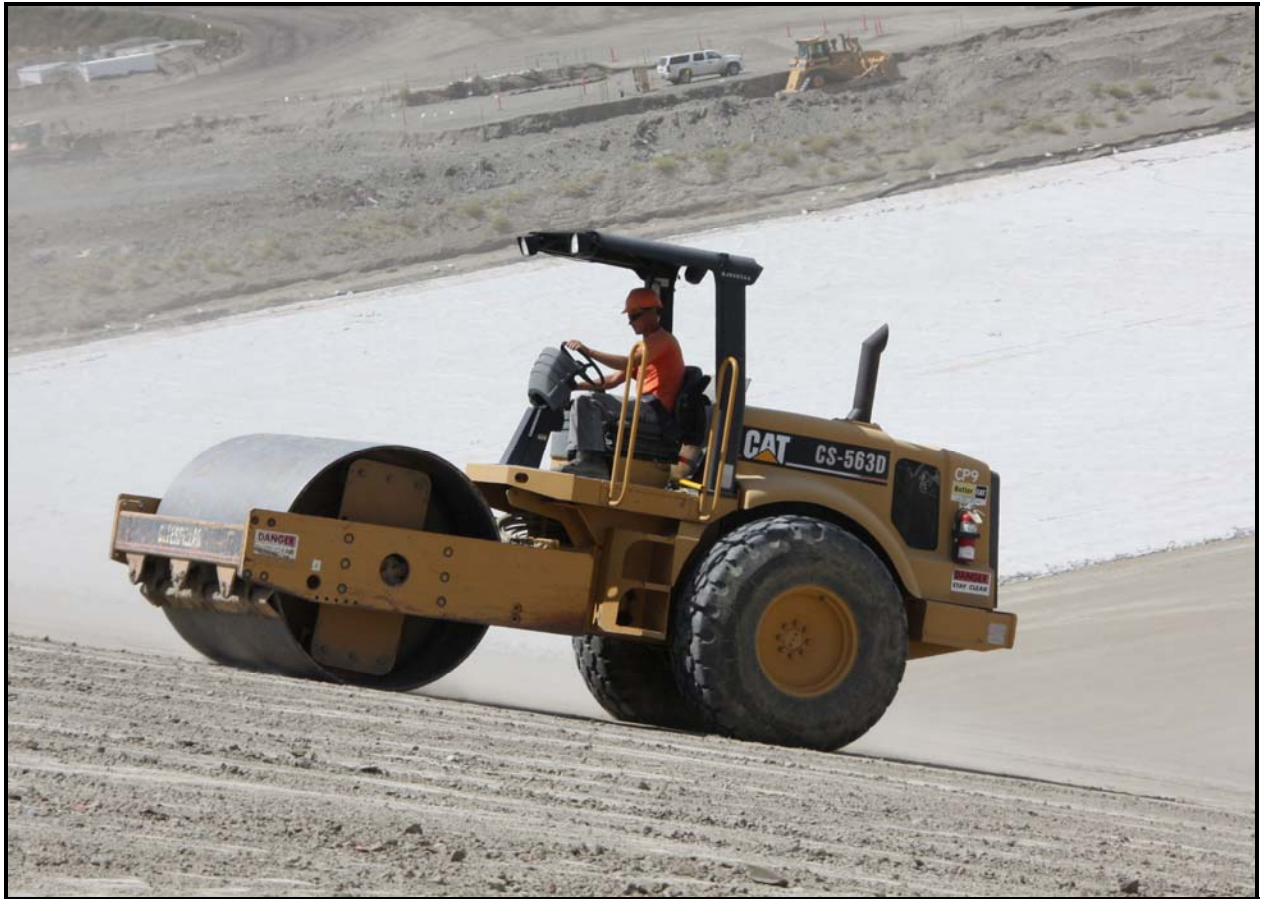
A worker rolls admix on the south slope of super cell 10 at the Environmental Restoration Disposal Facility.