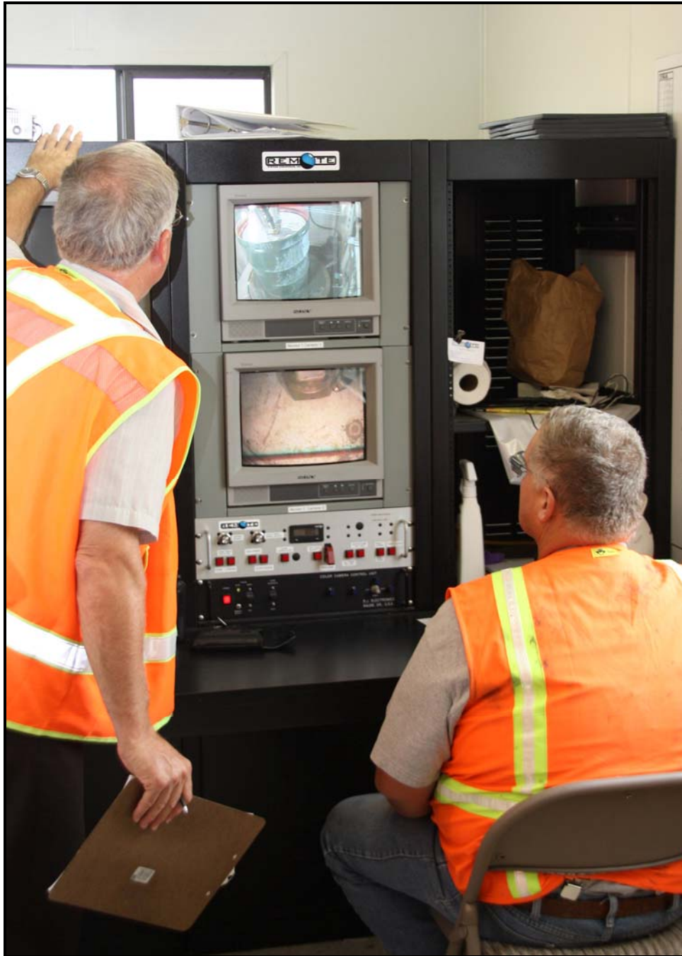
Washington Closure Hanford employees monitor a drum being punched inside the drum punch facility during mock-up activities at the 618-10 Burial Ground.

In early July, WCH awarded a subcontract worth nearly $3.7 million to install water, electricity, roads, office trailers, and waste container transfer areas at the 618-10 Burial Ground. White Shield/Apollo is a small, disadvantaged joint venture between White Shield Inc. of Pasco,