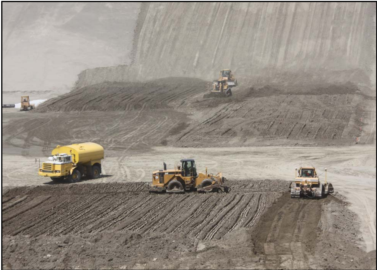
Washington Closure Hanford subcontractor TradeWind Services works to install admix in super cell 10 at the Environmental Restoration Disposal Facility.

Approximately 57% of admix used in the liner system has been placed in super cell 10. Earlier this month, the project team completed the placement of approximately 90,000 cubic yards of admix in super cell 9.