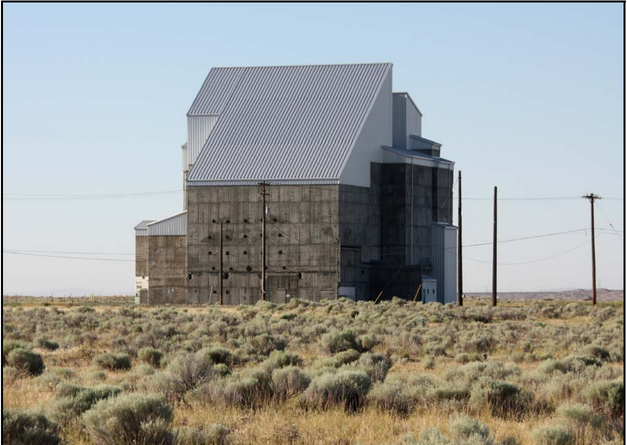
F Reactor was the third of Hanford's three original nuclear reactors. It was cocooned in 2003, making it the third Hanford reactor to have its core encased in a concrete shell.