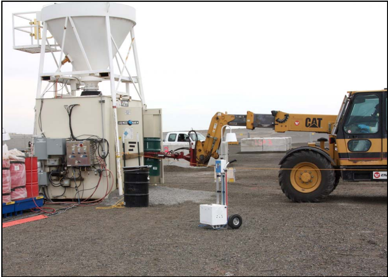
A drum is placed in the drum punch facility during mock-up activities at the 618-10 Burial Ground.