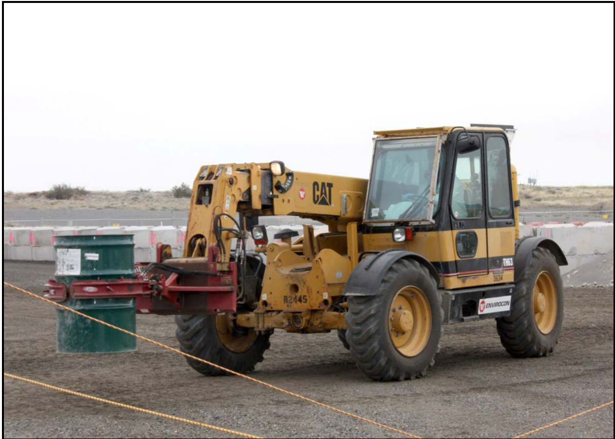
A telehandler transports a drum to the drum punch facility during mock-up activities at the 618-10 Burial Ground. Intrusive characterization is scheduled to begin in early August.

The project team continued to perform mock-ups of drum characterization techniques, instrumentation, and procedural steps required in work packages. Mock-ups of the drum-penetration facility also were conducted. Because the burial ground might contain potentially flammable material, unearthed drums will be opened in an onsite penetration facility with negative air pressure and remotely operated equipment. A sand hopper will be used to quench chemical reactions. The development of procurement packages for trench remediation labor and equipment also continues.