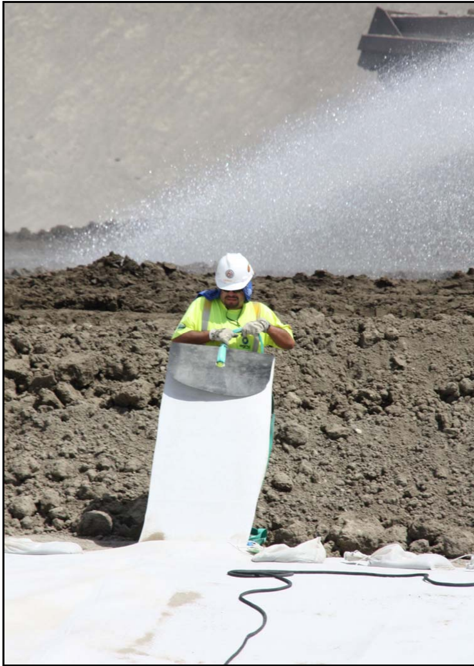
A worker installs a section of the primary high-density polyethylene liner (HDPE) in super cell 9 at the Environmental Restoration Disposal Facility. The HDPE is installed in 540-by-24-foot rolls.