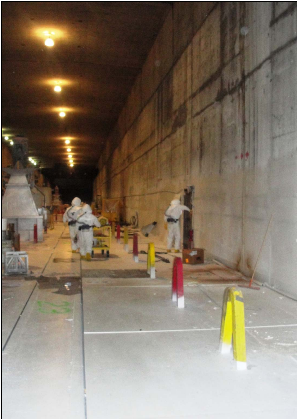
Following the application of contamination fixative, workers in the U Canyon remove the cover from an "R" door to gain access to the stairwell.