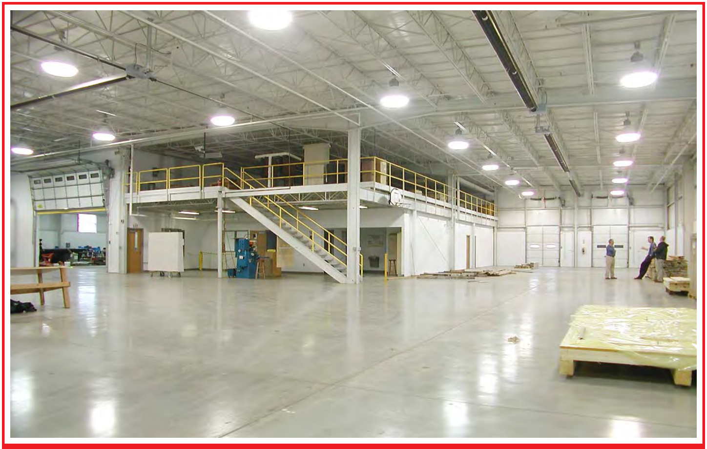
OFFICE SPACE WITH MEZZANINE