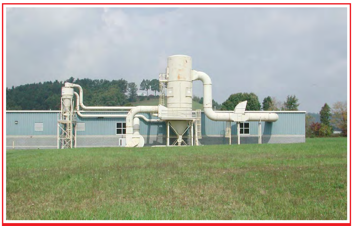
DUST COLLECTION SYSTEM