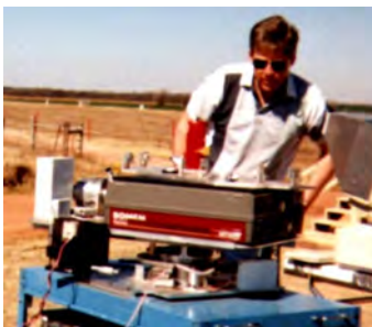
Figure 4. The absolute solar transmittance interferometer (ASTI).

The absolute solar transmittance interferometer (ASTI; Hawat et al. 2002) is a passive solar tracking radiometer. The ASTI has a resolution of 0.6 \text{ cm}^{-1} (half width at half maximum) and a spectral range of 1 to 5 \text{ }\mu\text{m} ( 10000 - 2000 \text{ cm}^{-1} ). The ASTI has a narrow field-of-view equivalent to the central 16% of the solar disk. The instrument is calibrated using a reference tungsten lamp with a maximum temperature of 2800 \text{ K} . Tests done to determine the accuracy and stability of the instrument, in conjunction with the lamp's rated uncertainty of 1-2% (wavelength dependent), yield an absolute uncertainty of less than 5% and a relative uncertainty of approximately 1%.