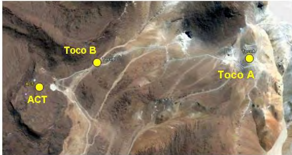
Figure 8. Annotated map indicating locations of the three preferred sites on Cerro Toco.