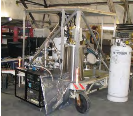
Figure 2. The far-infrared spectroscopy of the troposphere (FIRST).

The far-infrared spectroscopy of the troposphere (FIRST) instrument was recently developed at NASA Langley Research Center. The FIRST is a passive instrument that measures downwelling infrared radiance at 0.625 \text{ cm}^{-1} resolution over the range 6.25 to 100 \text{ }\mu\text{m} ( 1600 - 100 \text{ cm}^{-1} ). The FIRST consists of a scene select mirror, a Fourier transform spectrometer (FTS), aft optics, a detector assembly, and associated electronics [Mlynzack et al., 2005, 2006]. The FTS and aft optics are cooled to \sim 180 \text{ K} by liquid nitrogen, the detectors are cooled to 4.2 \text{ K} by liquid helium, and the rest of the instrument is at ambient temperature. The FIRST was deployed at the University of Wisconsin – Madison from 21-28 March 2007 so that FIRST and AERI