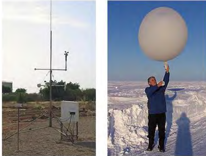
Figure 7. Passive in situ sensors mounted on a tower (left) and periodic radiosondes (right).

We will measure temperature, humidity, and pressure both at the surface using passive in situ sensors mounted on a small tower (left) and aloft using periodic radiosondes (right). We also will measure wind speed and direction at the surface. Currently we are not planning to measure wind aloft with the radiosondes. Measurements from the radiosondes will be collected with a Vaisala Digicora-III receiver using VHF telemetry in the range 400-406 MHz.