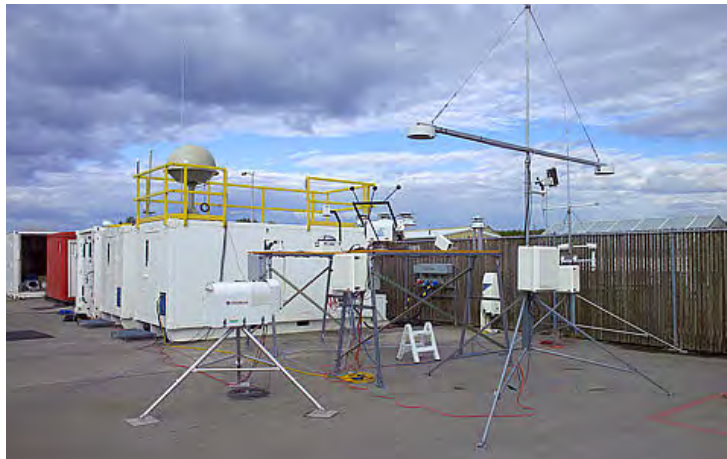
Figure 10. Container for deployment. The two containers nearest the instrument field above are among those to be deployed for RHUBC-II. Many of the instruments in the foreground are among those to be deployed for the campaign.

All RHUBC-II instruments will be located within a fixed boundary indicated by the solid line in Figure 9. Currently we are planning to install a fence on this perimeter with the approval of CONICYT. This fence will be removed at the end of the experiment. Instruments from the FIRST shelter and one of the ARM shelters will be rolled out onto the radiometer field on mornings when staff members are on site. Also there will be several fixed instruments in this area including the broadband radiometers and the 183-GHz microwave radiometer.