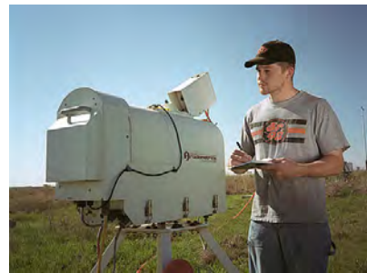
Figure 3. The MP-183.

The MP-183 is a passive microwave radiometer that was developed and built by Radiometrics Inc. The MP-183 uses a single blackbody and a noise diode / dicke switch combination (similar to the microwave radiometer [MWR] and microwave radiometer profiler [MWRP]) to monitor the gain of the radiometer. Periodic views of a liquid-nitrogen target are used to monitor the calibration of the noise diode. It utilizes a single frequency agile synthesizer to measure emission from 170.0 to 183.31 \text{ GHz} at user-selectable frequencies. The MP-183 is thus a single sideband instrument. The bandpass is 1 \text{ GHz} . Radiometrics has garnered tremendous experience in building and operating MWRs in long-term autonomous mode and this experience was incorporated into the design of the MP-183.