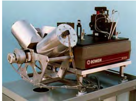
Figure 1. The atmospheric emitted radiance interferometer (AERI).

The atmospheric emitted radiance interferometer (AERI; Knuteson et al., 2004a,b) is a passive automated ground-based interferometer that measures downwelling infrared radiance at 0.5 \text{ cm}^{-1} resolution over the range 3.3 to 25 \mu\text{m} ( 3000 - 400 \text{ cm}^{-1} ). The ARM Program has deployed AERIs at nearly all its climate research facilities, and extensive data sets (more than a decade at the SGP site and nearly eight years at the NSA site) have been collected. The AERI has been the focal point for several radiative closure studies in the ARM Program, and we have extensive experience working with this instrument. Due to its well-understood nature, its spectral overlap with the other far-IR instruments in the experiment will be of great value.