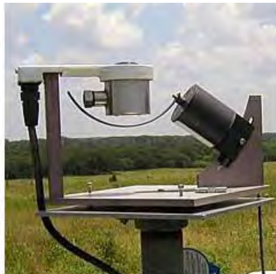
Figure 6. A set of four radiometers.

In addition to the three spectrometers, the suite of RHUBC-II instruments will include a variety of passive radiometers. A set of four radiometers (left) will provide continuous measurements of downwelling broadband shortwave (solar) and longwave (atmospheric or infrared) irradiances. These will each be Eppley