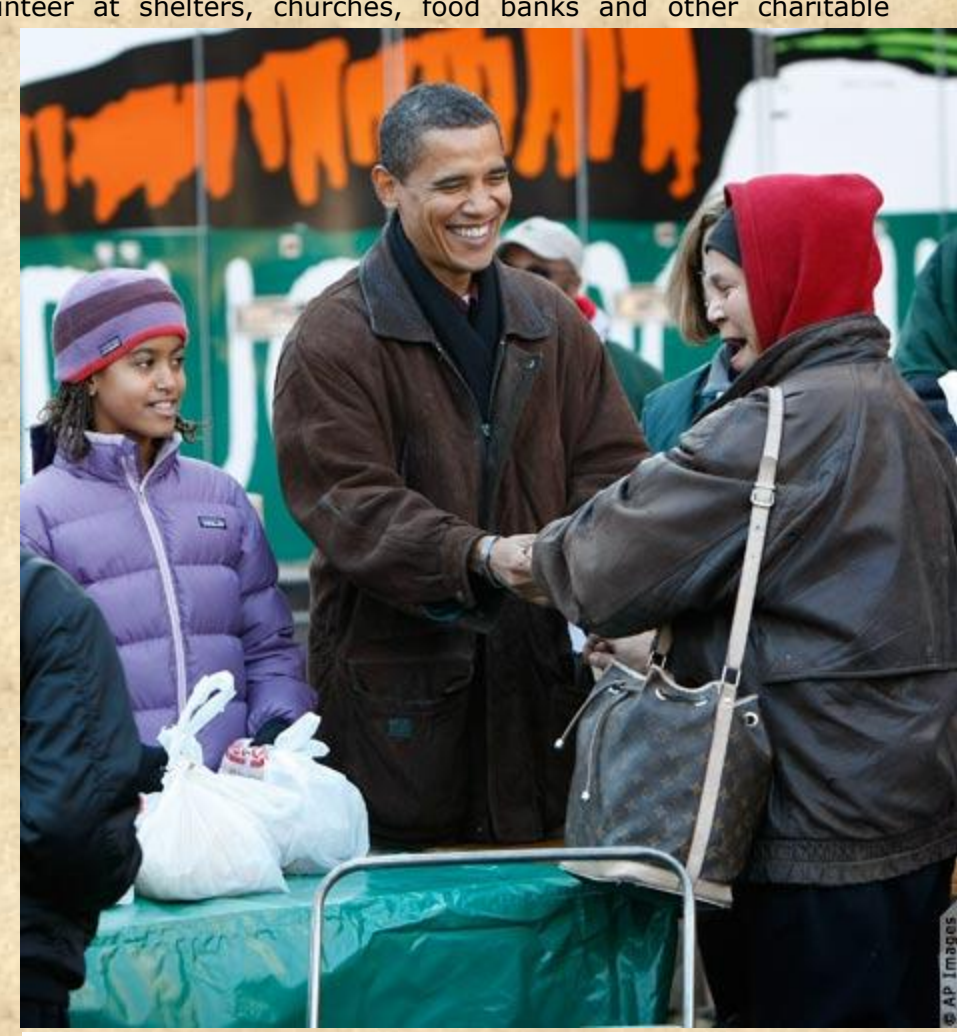
On Thanksgiving 2008, then President-elect Barack Obama and his family distributed food at St. Columbanus Catholic Church in Chicago.

2008, President-elect In then Obama and his family set an example by helping distribute food church in Chicago Thanksgiving Day, and in a radio message he thanked those people across the United States who had "pitched in time and resources to give a lift to their neighbors in need. It is this spirit that binds us together as one American family the belief that we rise and fall as people." Thanksgiving, one generally centers on a dinner of roast turkey, and thus food drives across the country focus on that main ingredient of the Thanksgiving feast.