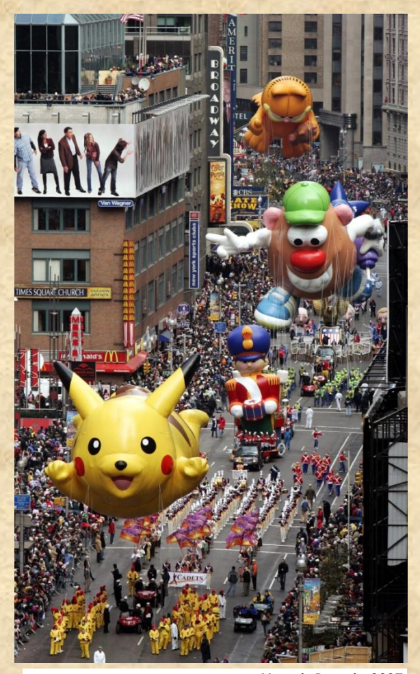
Macy's Parade 2007.

http://www.macysparade.com/ http://www.nbc.com/Macys Parade/