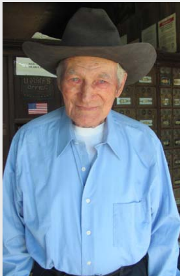
August 2012