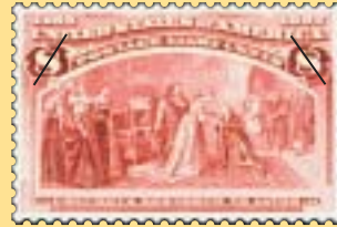
Columbus Restored to Favor