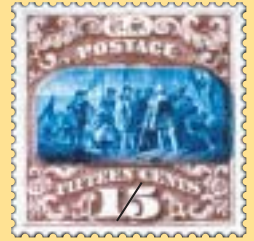
Landing of Columbus