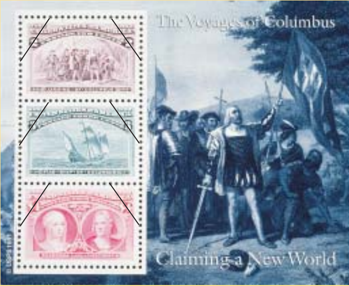
Claiming a New World