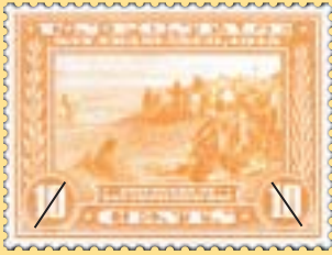
Discovery of San Francisco Bay

The Panama-Pacific International Exposition opened in San Francisco, California, on February 20, 1915. The Exposition honored the discovery of the Pacific Ocean and the completion of the Panama Canal. The following series of stamps was issued in denominations of 1, 2, 5, and 10 cents to commemorate the opening of the Panama Canal and the discovery of the Pacific Ocean: