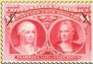
Isabella and Columbus