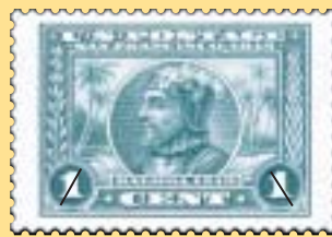
Vasco Núñez de Balboa