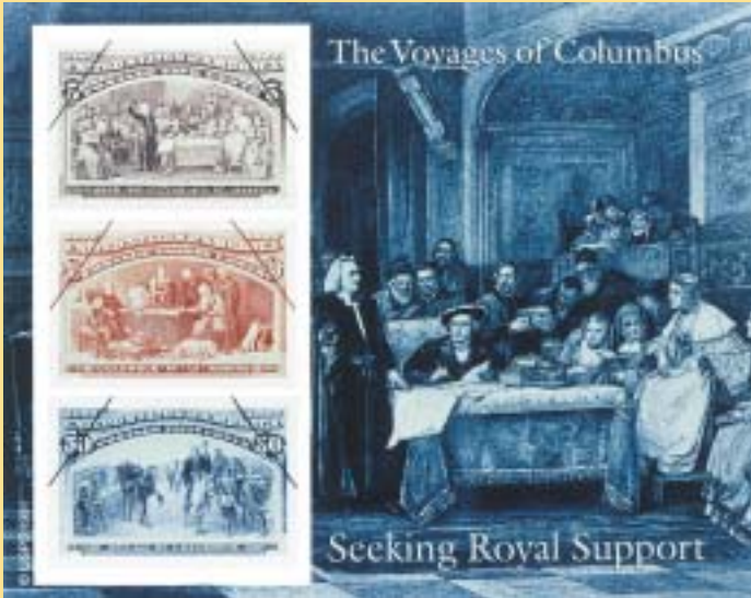
Seeking Royal Support