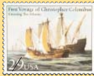
Crossing the Atlantic