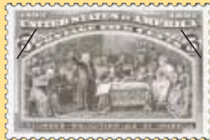
Columbus Soliciting Aid of Isabella