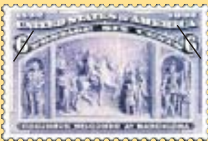
Columbus Welcomed at Barcelona