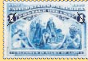
Columbus in Sight of Land