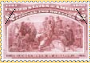
Columbus in Chains