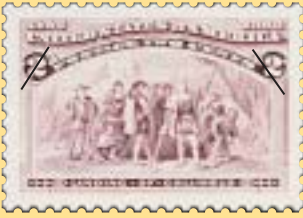
Landing of Columbus