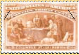
Columbus at La Rábida