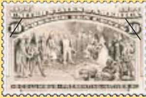
Columbus Presenting Natives