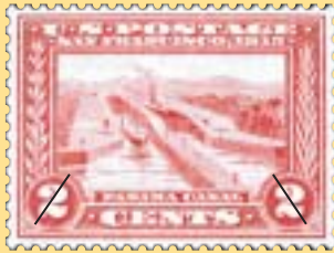
Pedro Miguel Locks, Panama