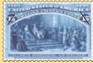
Columbus Announcing His Discovery