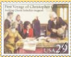
Seeking Queen Isabella's Support