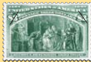
Columbus Describing Third Voyage