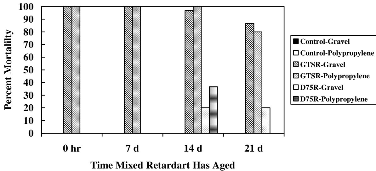
Figure 1. Percent mortality of fathead minnows exposed for 24 hours to Fire-Trol® GTS-R, Phos-Chek® D75-R, and a control weathered under environmental conditions on non-porous polypropylene and river gravel substrates.