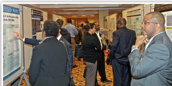
Attendees view the scientific posters at the NMRI 8th Annual Workshop

This year’s posters presented outstanding research being conducted at numerous academic institutions by NMRI members. Poster abstracts included research on diabetes, kidney diseases, obesity, and physical activity; trial interventions in minority populations; and basic research investigations on proteins, lipids, and genes or gene products.