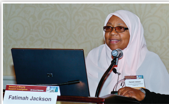
Dr. Fatimah Jackson speaks during dinner at the NMRI 8th Annual Workshop

Potential applications of ethnogenetic layering models in discerning gene and gene-environment interactions in health include: pharmacogenetics; evaluation of environmental toxicant exposure; risk assessment for prematurity and low birth weight; susceptibility to nutritional toxicants (e.g., celiac disease); hypertension, salt sensitivity, and stroke susceptibility; organ-tissue transplant compatibility; breast cancer risk (especially triple negative, aggressive, early onset breast cancer); and end-stage renal disease genetic risk and environmental triggers.