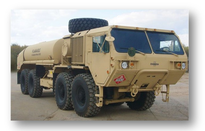
Heavy Expanded Mobility Tactical Truck (HEMTT)

Point of contact for this article is SFC (P) Lovd. (804)734-2903,(DSN 687).