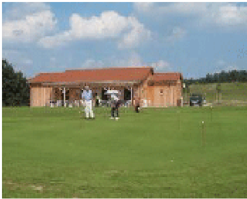
Golf club Maria Hausen eV