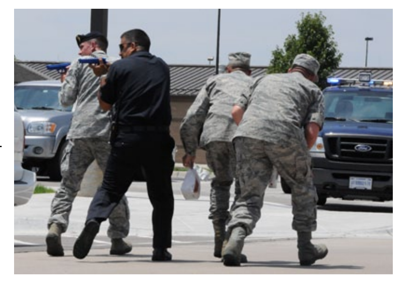
During a basewide exercise, Security Forces personnel help victims reach a safe area while protecting them from an active shooter.

A short time after the explosion, the master sergeant drove his vehicle to building 40 on the west side of the base. As he entered the building, he shot two bystanders and, once inside the building, the suspect shot another. He continued to terrorize the employees inside until security forces arrived. According to eyewitnesses, as the suspect reached for another gun, the security team opened fire, fatally wounding him.