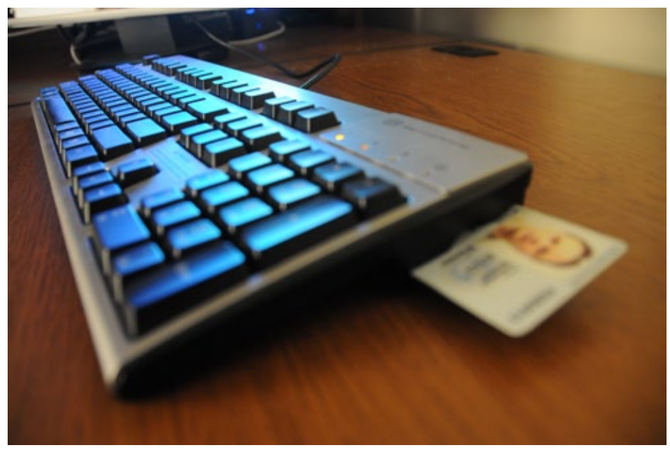
Common access cards, or CACs, left unattended is an example of poor physical security and would've had a negative effect on the CCRI's results.