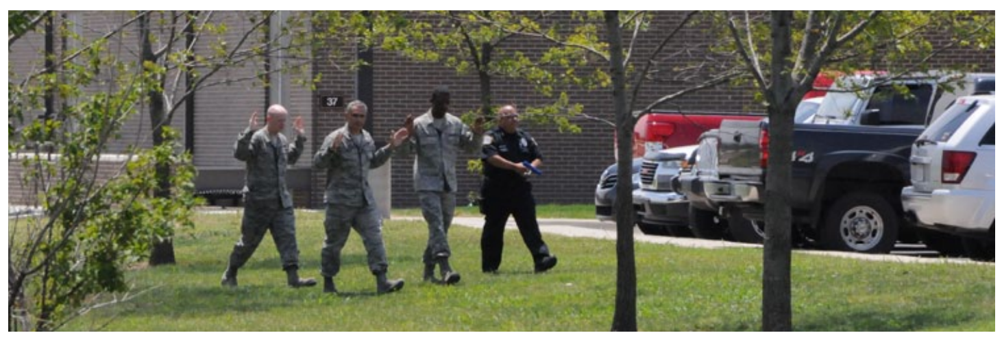
During an exercise, Security Forces personnel escort Airmen out of a building where an active shooter threatened the lives of people inside.

McConnell AFB has three separate entities on the installation which include the 184th Intelligence Wing, the 931st Air Refueling Group and the 22nd Air Refueling Wing. To make things more complicated, the three organizations belong to different components of the Air Force between the Air National Guard, the Air Force Reserve and the Active Air Force. The 22nd Air Refueling Wing is the host unit on McConnell AFB and runs most of the emergency operations. However, the two tenant