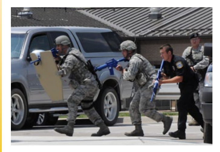
Security Forces personnel prepared to enter a building that was held by an active shooter.