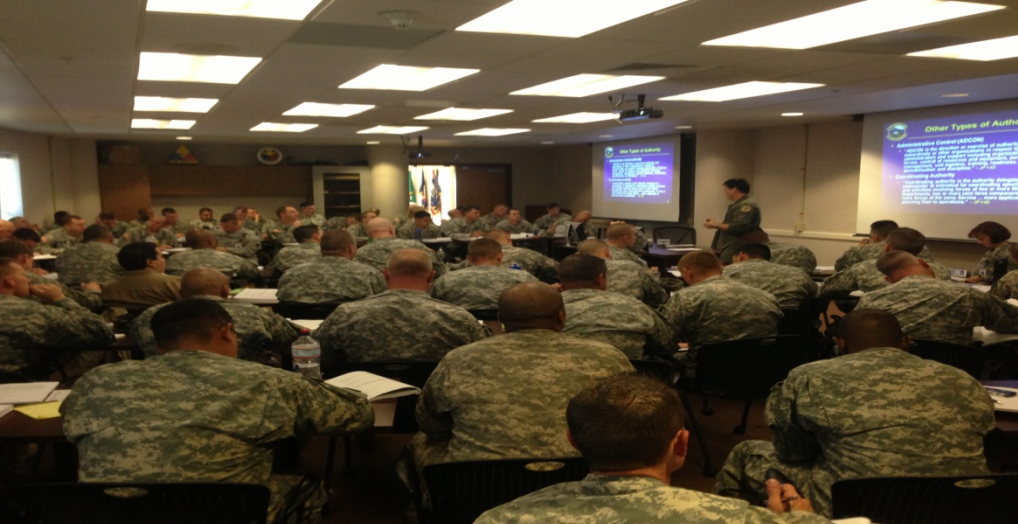
Maj Augustino provides instruction to OC/Ts from NTC OPS Group

- 68 of 70 students graduated; one student had to drop out; one student failed to meet the test standards.