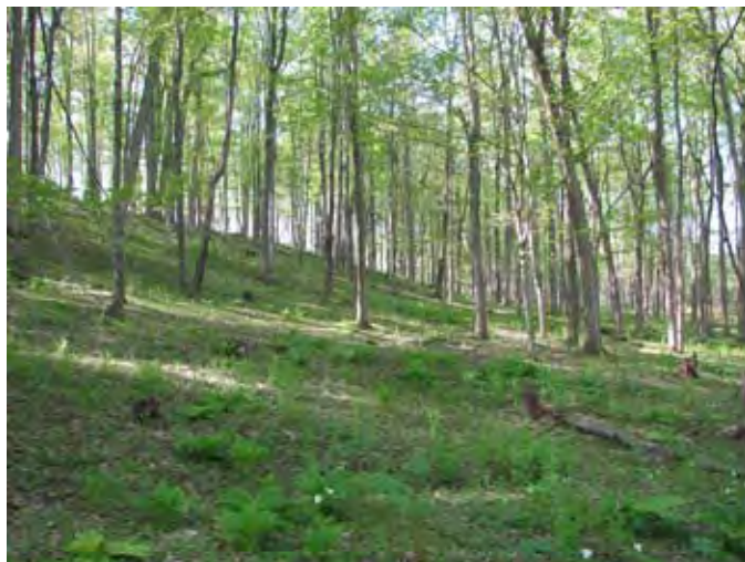
FIGURE 3.—A Cayuga County, NY, sugar maple forest shows a few surviving white trilliums in the foreground.