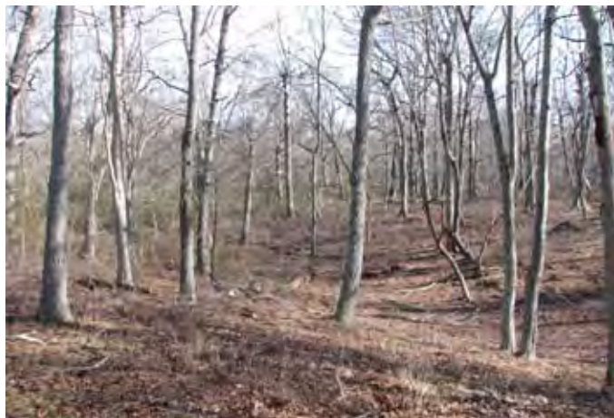
FIGURE 2.—This Suffolk County, NY, oak forest shows evidence of white-tailed deer overabundance.

What's wrong with this picture (Figure 2)?