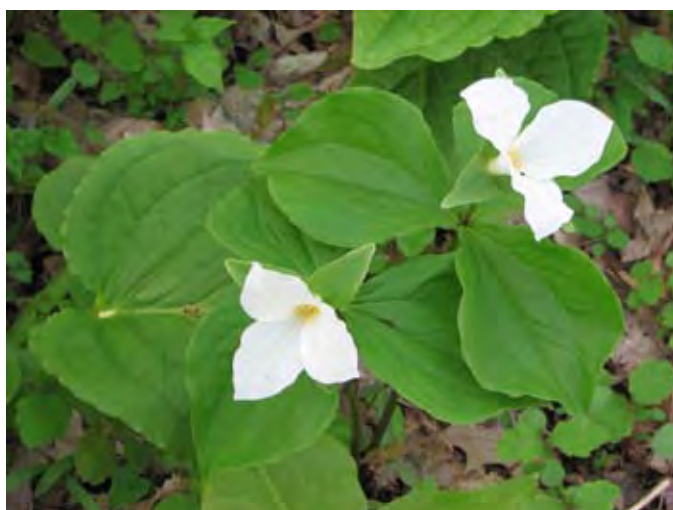
FIGURE 4.—White trillium, a native wildflower, can be decimated by deer (Rooney and Gross 2003).

White-tailed deer have been described as keystone species in forest ecosystems (McShea and Rappole 1992; Rooney 2001; Rooney and Waller 2003), implying that their feeding activity can directly and indirectly affect many other species. It has been said that deer are grazers by choice, browsers by necessity. During the spring and summer they feed primarily on herbaceous plants and the leaves of woody plants. In the fall, acorns and fallen fruits are favored. Browsing of woody stems is prevalent in winter, when other food sources are usually in short supply.