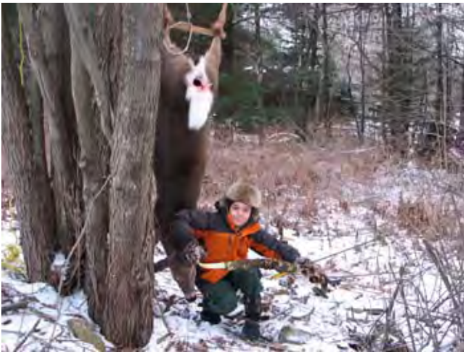
FIGURE 6.—Hunting remains an important tool in the management of white-tailed deer populations.

Landowners are encouraged to monitor deer impacts and, when necessary, to seek guidance from natural resource professionals who may be able to suggest remedial measures such as hunting, culling, fencing, repellents, scare devices, vegetation management options, or integrated combinations of these (Figure 6). Such measures may not eliminate deer damage, but reduce it to tolerable levels. Many sources of helpful information exist (e.g., Curtis and Sullivan 2001; Decker and others 2004; Ebersole 2006; Latham and others 2005; Pierce II and Wiggers 1997), but the problem remains large. Different regions and different sites within the same regions may face very different sets of challenging circumstances.