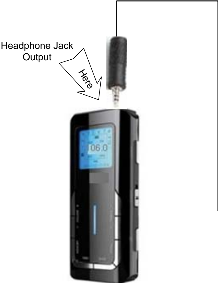
Battery Powered CE Certified Portable FM Radio