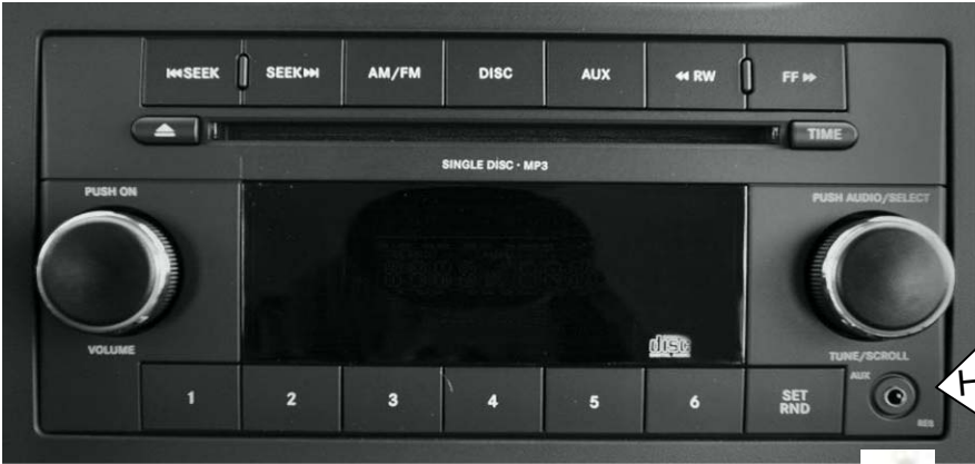
US Spec Factory Car Radio with AUX Jack Input