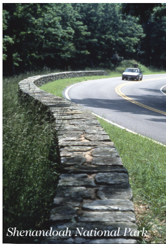
Shenandoah National Park