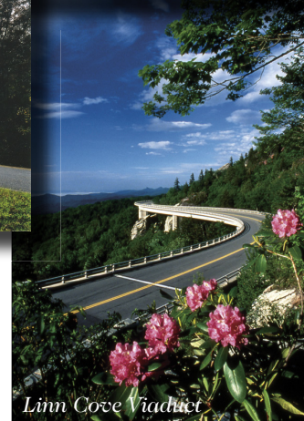
Linn Cove Viaduct