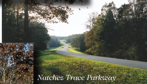
Natchez Trace Parkway