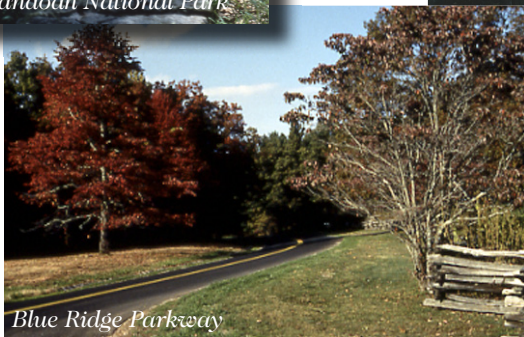
Blue Ridge Parkway