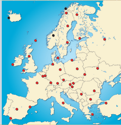
Locations of INTERMAGNET observatories (red) and other prominent observatories (black)

• The 3rd Munich Earth Science School (MESS), 10-15 March, 2013. This year the winter school MESS will focus on Python/Obspy tools for seismic data access and processing, combined with a novel archiving scheme (seishub) for Earth science data. It will walk through such a complete cycle with data access, processing, storage and visualization tools based on the python language. This will be complemented by training on the use of a 3-D spectral element solver (ses3d) for the generation of synthetic seismograms. MESS 2013 addresses researchers who deal with large seismological or seismic data sets on all scales and seek new ways of solving the data deluge problem. More information and registration details can be found here: www.geophysik.uni-muenchen.de/MESS/2013