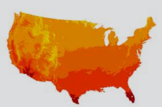
TACCIMO provides mapping resources that enable access to temperature and precipitation projections from a range of climate models and scenarios. Custom tools enable quick comparison of projects and identification of the range of projected climate conditions.

In addition to a detailed user guide, TACCIMO provides case studies; quick start guides with basic instructions for navigating the tools and resources, generating reports and using its mapping tool; and demonstration and training sessions to help land managers and planners effectively use TACCIMO's tools and create custom reports.