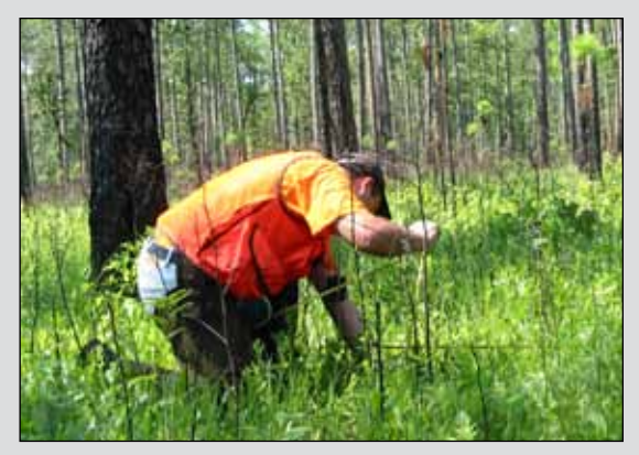
TACCIMO highlights both direct and indirect effects of climate change-including impacts on biodiversity, natural disturbances, and wildfire-and helps identify possible mitigating management options.

TACCIMO also allows users to explore future climate projections and related geospatial information through an integrated mapping tool. The TACCIMO experience culminates in an exportable report that documents climate change science and climate forecasts (including maps and figures) and provides interpretive guidance. Collectively, TACCIMO's tools and resources enable users to keep pace with, and accurately consider, climate change in natural resource management activities.