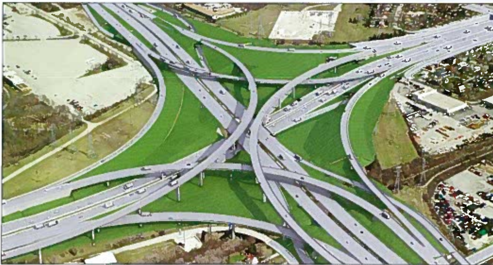
A 3D view of the planned Zoo Interchange, looking northeast

The purpose of this newsletter is to keep you informed and to invite you to stay involved in the project.