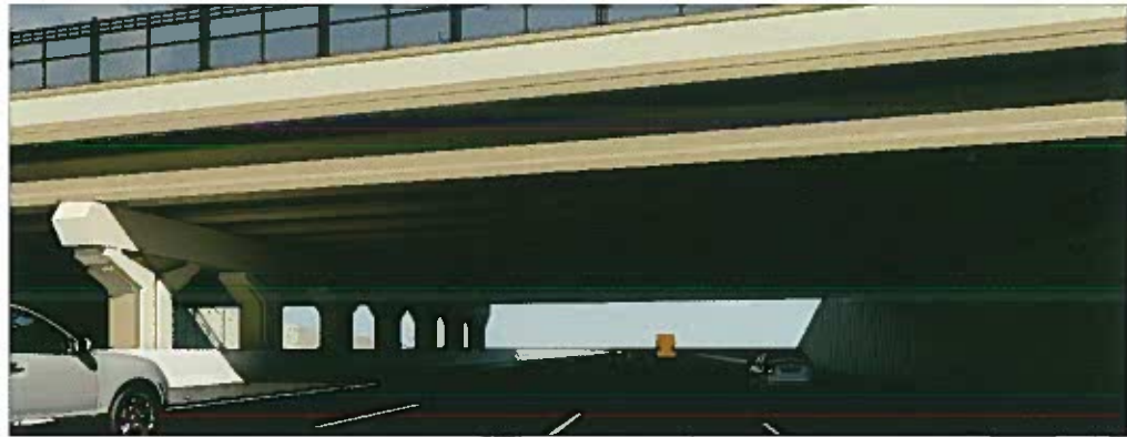
Typical bridge overpass

that improves the transportation work through the use of fencing, landscaping, walls, bridge work and specific color schemes to enhance the surrounding area.