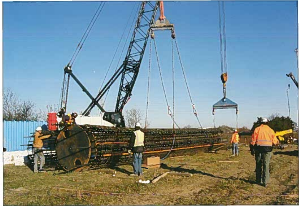
Crew assembling steel reinforcement for a drilled test shaft to determine the ability of the soil to support the Zoo Interchange bridges.

65+ bridges, which is 1.26 million square feet of bridges. 100+ retaining walls, which is 11 miles of retaining wall.