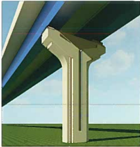
Typical pier structure for the core of the Zoo Interchange

Community Sensitive Solutions (CSS) is a community-based approach to planning and designing transportation projects. The focus is on how the roadway appears to the surrounding community. The CSS process helps WisDOT achieve a vision