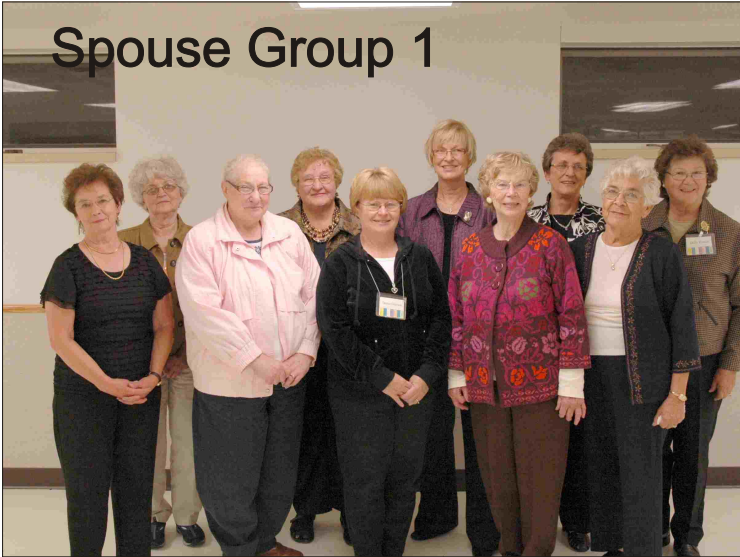
Spouse Group 1