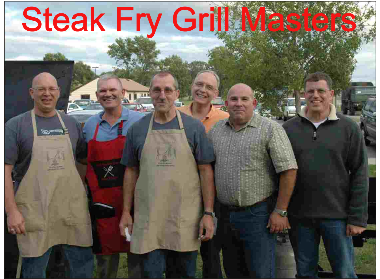
Steak Fry Grill Masters