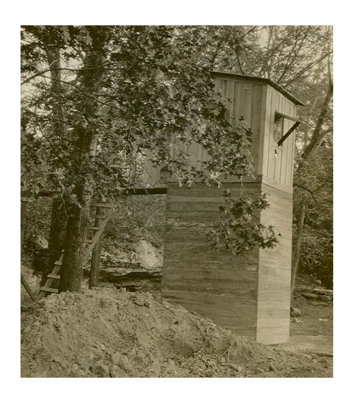
Iola streamgage in 1917