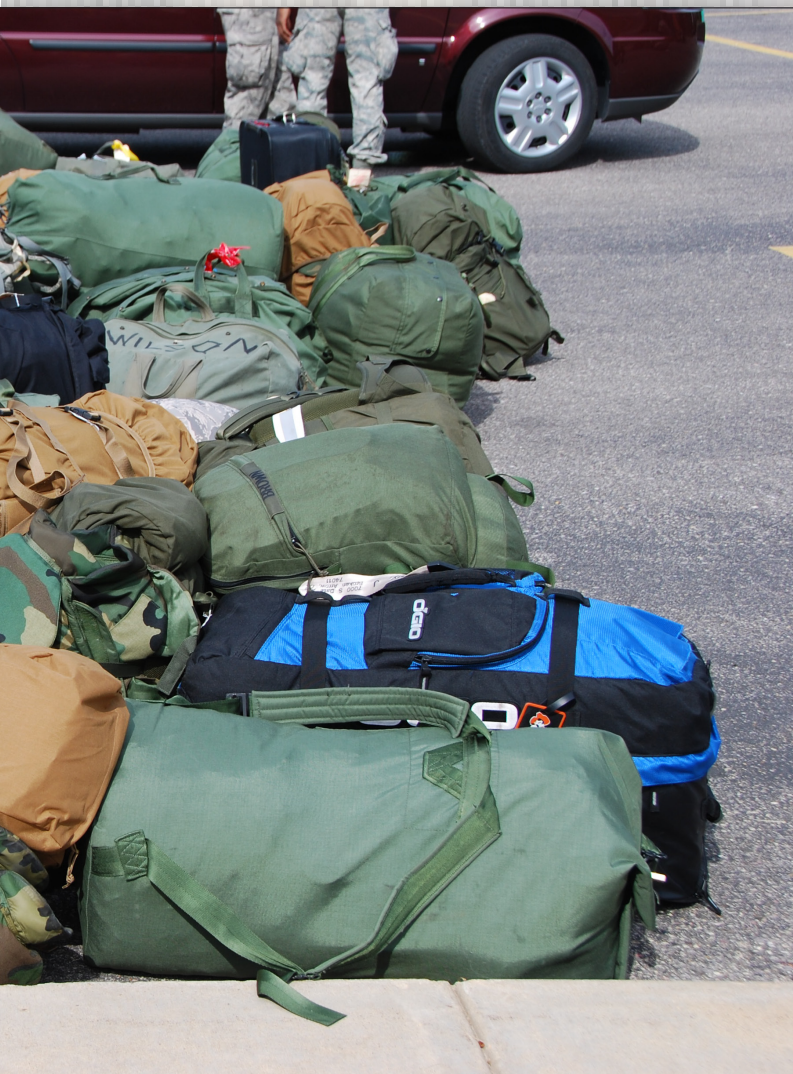
” or groups. Their baggage flew with them, as well, and was me to depart.