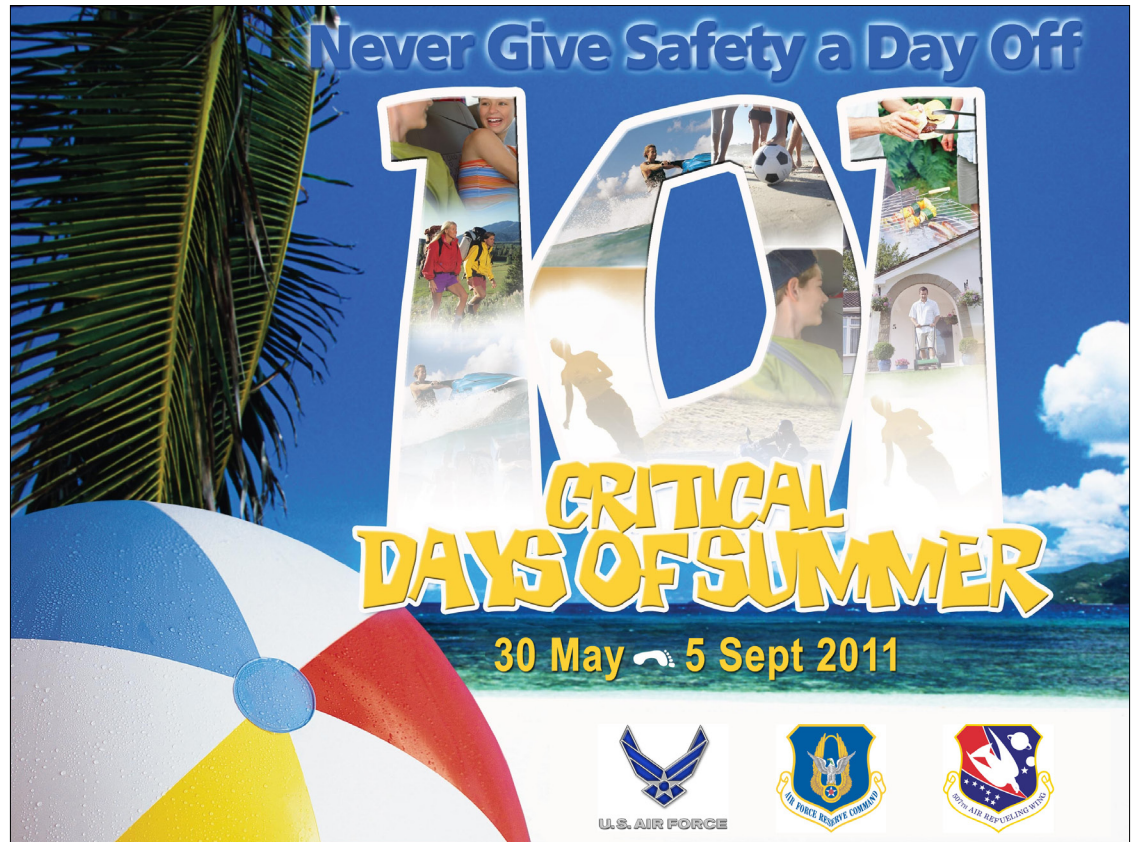
U.S. Air Force illustration by Tech. Sgt. Grady Epperly

“Unfortunately, last summer we lost 16 Airmen. While this was an improvement over the 21 lost the previous year, we must strive to do better. The 2011 Air Force goal is zero preventable mishaps and fatalities. The leading causes of preventable fatalities during the Critical Days of Summer are off-duty private motor vehicle mishaps and drowning. We therefore emphasize the importance of fastening seatbelts, driving at reasonable speeds, and avoiding situations of driving while distracted, under the influence,