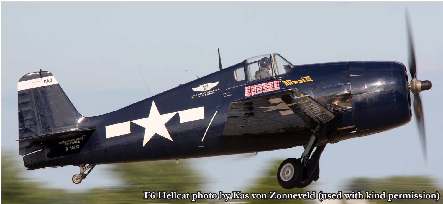
F6 Hellcat

ment of spotting the Japanese fleet, but also described the flight on Lyons's wing in great detail as they climbed through the very adverse weather they encountered. He was extremely close to his lead and although he was determined not to get separated as they returned to the ship, he was sure they were going to touch wings. Fortu-