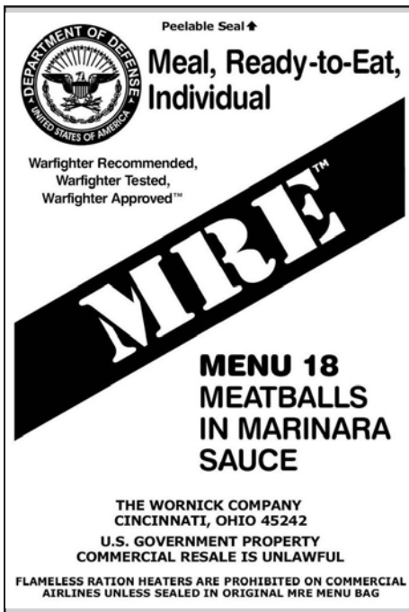
MRE Design 1

Here are a few bits of information about MREs you probably don't know.