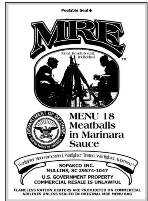
MRE Design 2