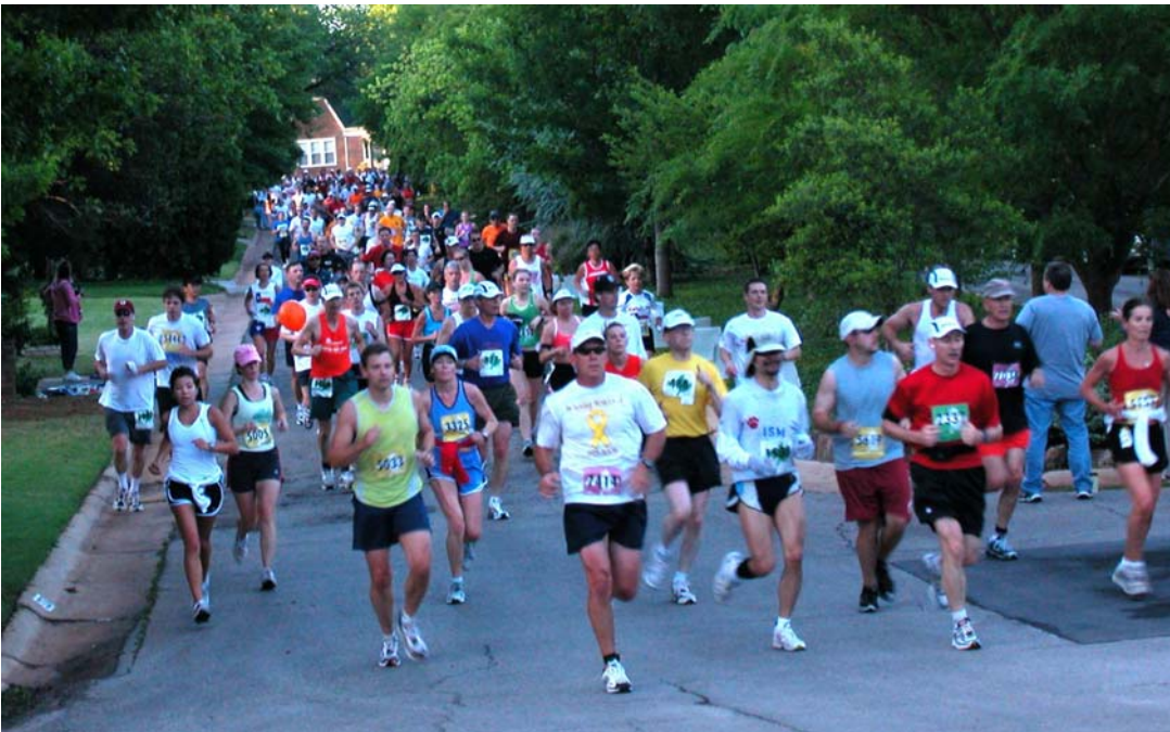
Runners charge down Harvey Pkwy during OKC Memorial Marathon April 30.