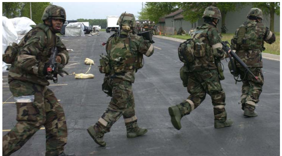
Sirens sound - enemy on base.