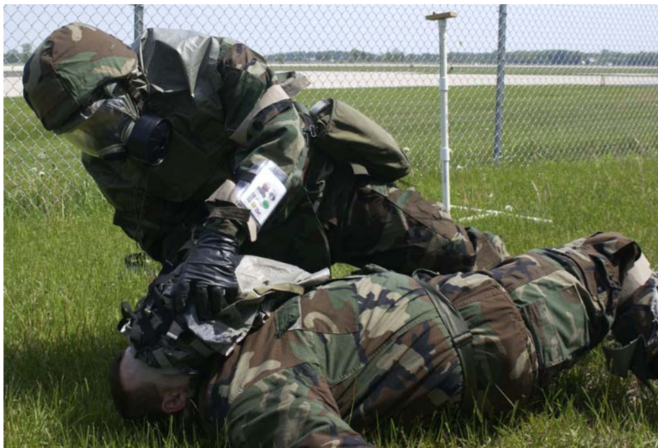
A buddy needs urgent care.

The ‘war’ scenarios began on Day 3. Participants were there to immerse themselves fully -- intellectually and emotionally, to live the scenarios, and execute with a sense of urgency. The heat was on.