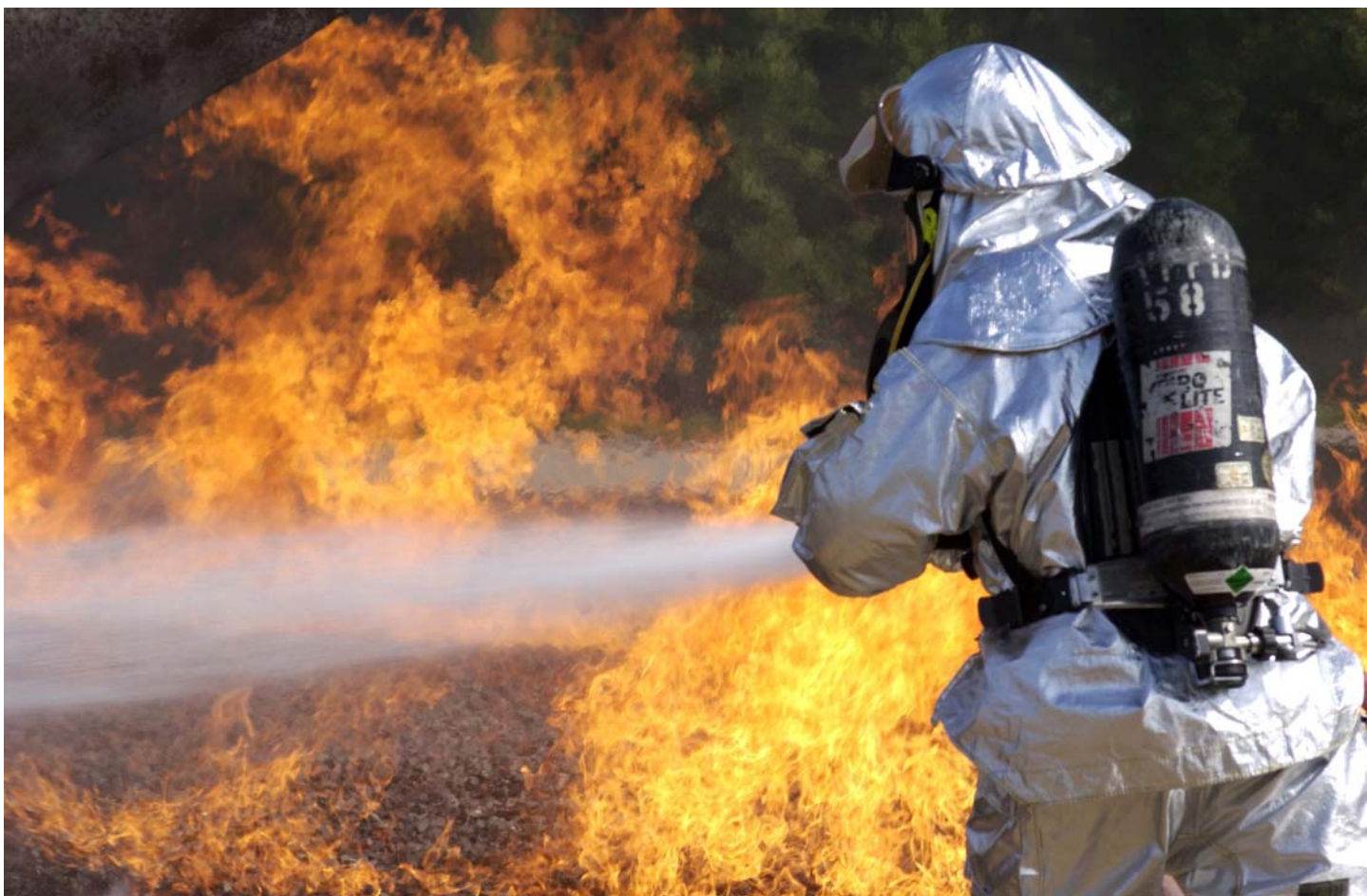
Flames flare up during simulated aircraft crash.