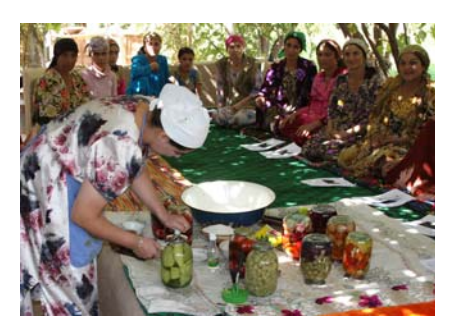
USAID helped train 1,000 women in the Rudaki, Shaartuz, and Qubodiyon districts to prepare winter preserves using various fruits and vegetables from their gardens.