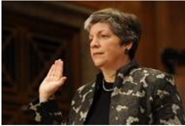
Secretary Napolitano being sworn into office

On January 21, 2009, Janet Napolitano was sworn in as the third United States Secretary of Homeland Security. Prior to her appointment, Secretary Napolitano was the Governor of Arizona and supported several DHS initiatives, including Citizen Corps. In May 2004, she signed an executive order establishing the Arizona State Citizen Corps Council. The Council was charged with developing a comprehensive, statewide plan that would support local Citizen Corps Councils across the state, and serve as Arizona's liaison to national and state organizations supporting community preparedness. Secretary Napolitano also supported Citizen Corps and community preparedness efforts through several state-wide public service announcements and by declaring September as National Preparedness Month in Arizona.