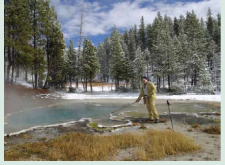
Biomass Deconstruction. Screen DNA samples from diverse environments to discover and develop the most efficient biological processes for deconstructing plant cell walls into sugars for biofuel synthesis.