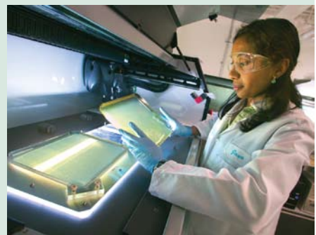
Microbial Biofuel Synthesis. Use metabolic engineering and synthetic biology to design microbes that streamline the cellulosic biofuel production process and produce next-generation biofuels.