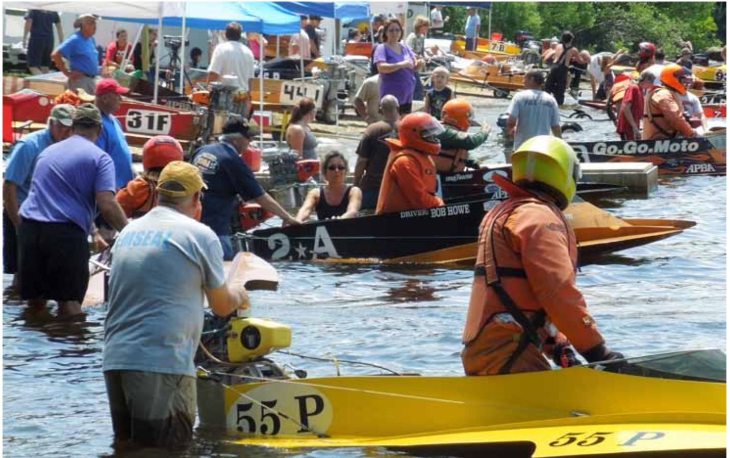
Boaters line up to race at West Thompson Lake during the annual regatta.