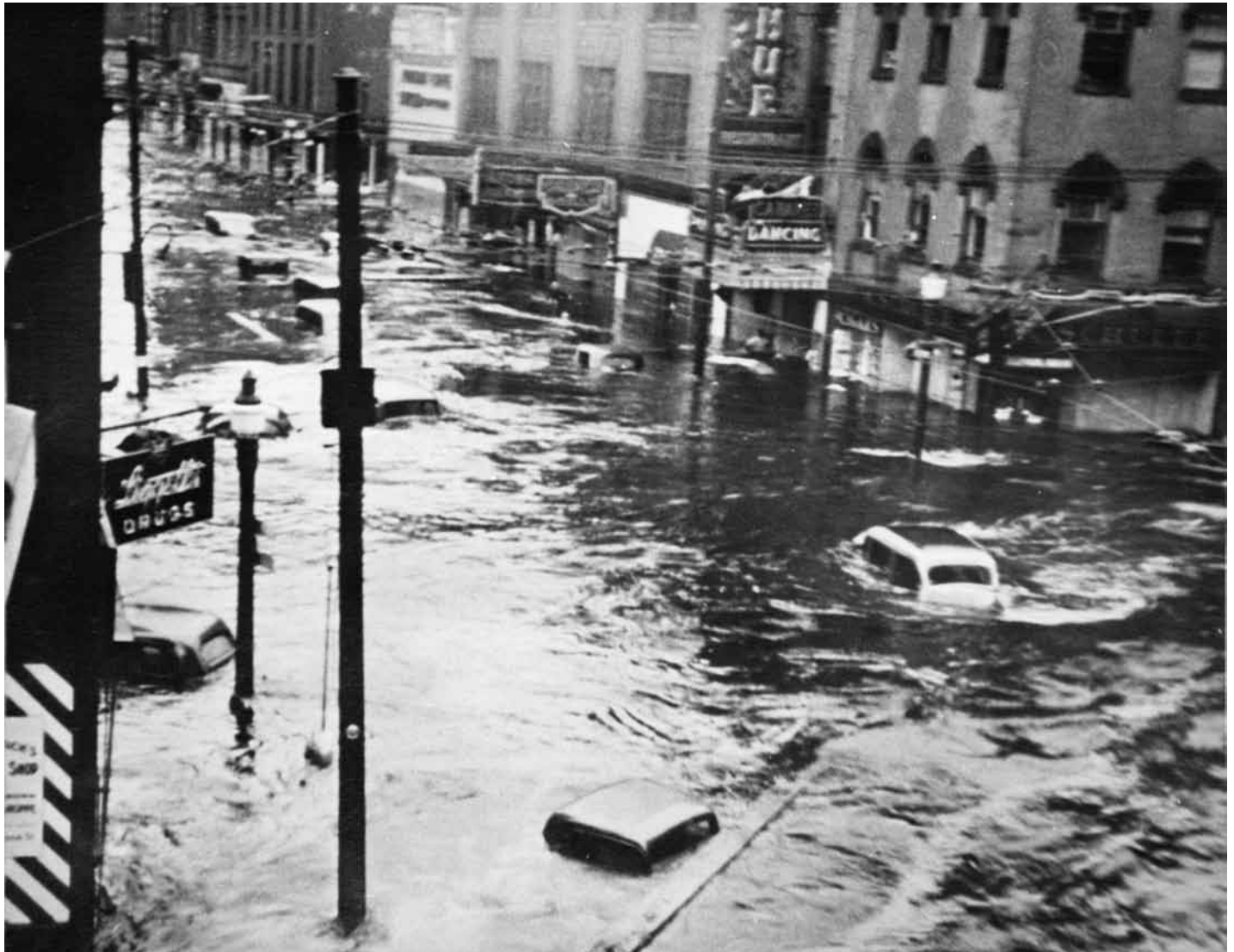
The Great New England Hurricane of 1938 leaves Providence, Rhode Island under water.