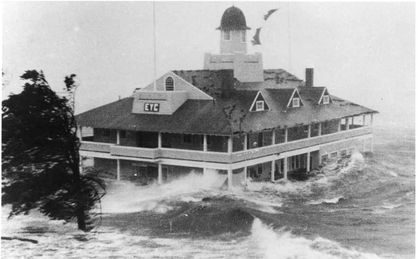
Angry seas churned up by Hurricane Carol tear at the Edgewood Yacht club in Cranston, R.I., as the club's signal hoist is reduced to tatters and its roof shingles lift in the wind.

Hurricane Donna was a Category 5 Cape Verde-type hurricane that impacted most of the Caribbean Islands and every single state on the U.S. Eastern seaboard. It recorded 160 mph winds with gusts up to 200 mph. 'Donna' holds the record for retaining