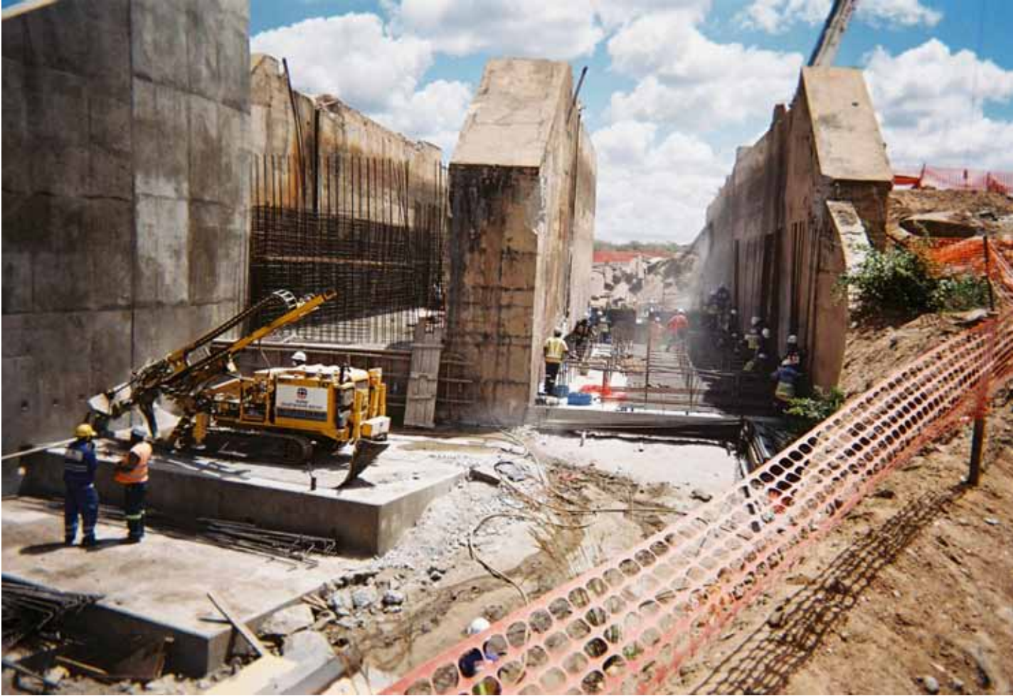
Construction on the Nacala Dam Rehabilitation project in Mozambique is currently underway.