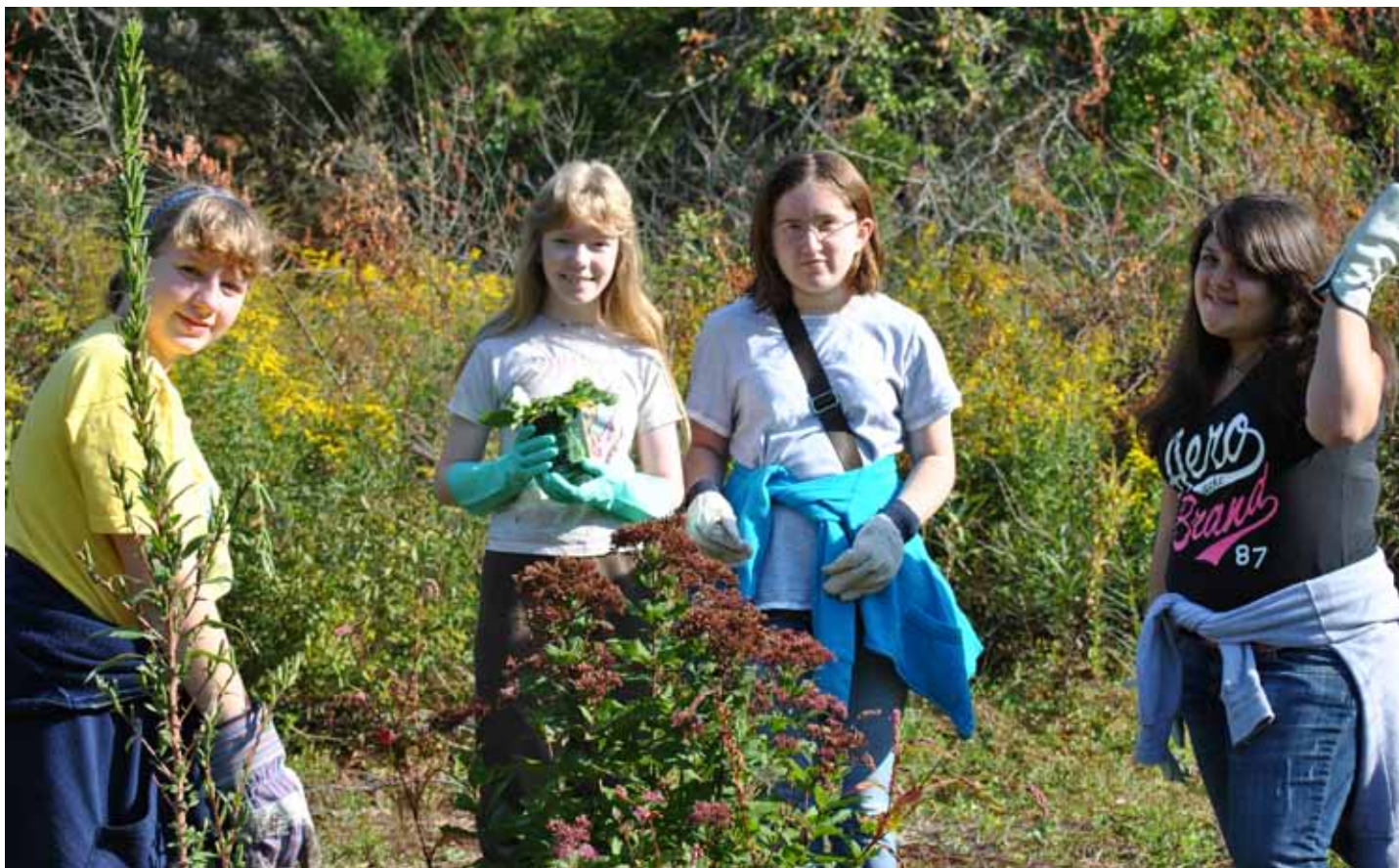
A Connecticut Girl Scout Troop works to improve a butterfly garden at Black Rock Lake.

New England District projects have participated in the nation's single largest volunteer event, that focuses on the care and stewardship of public lands, for over two decades.