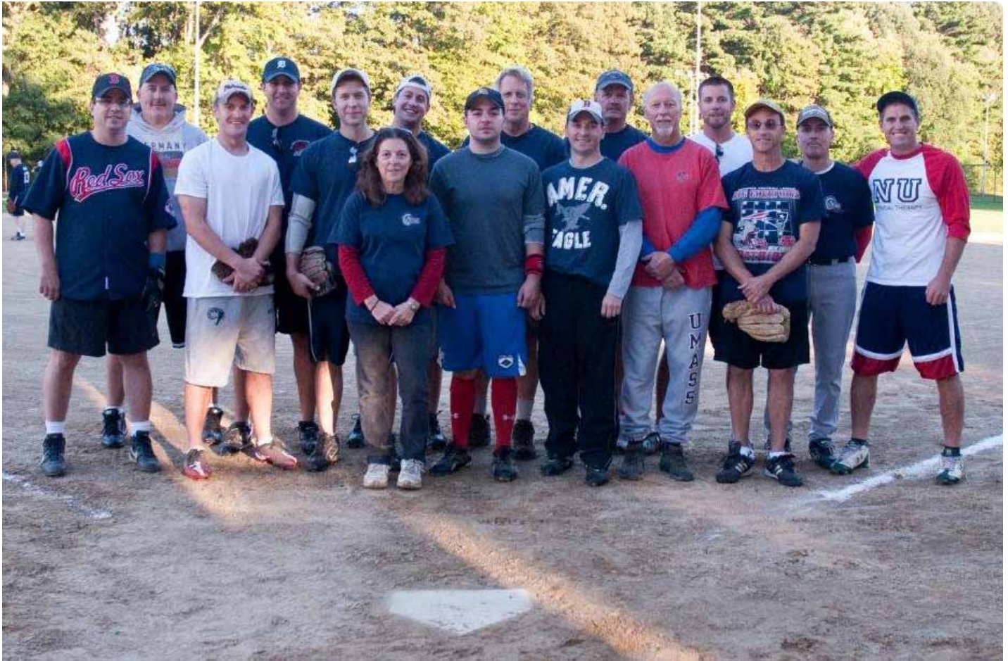
The New England District Softball Team 2012.