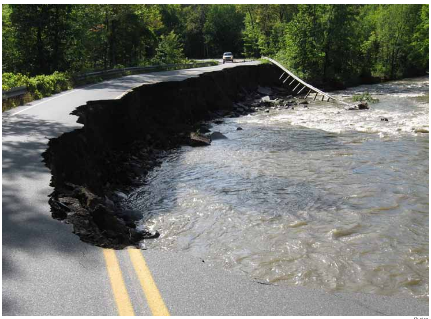
Hurricane Irene washed out many roads like the one above, causing delays hauling out material from Union Village Dam. Despite the challenges brought on by the storm, the District was able to complete the project on time.

The District and Tantara teams soon found that other challenges to get the project completed were before them: A near vertical wall in part of the channel blocked a clear line of sight; stirring up sediment in the water would cause too much turbidity; uncertainty over how quickly the sediment would dewater in the dewater ponds, and additional uncertainty regarding how much water it would produce. With each challenge came a solution: The contractor used a crane and a spotter to guide the crane operator; the contractor installed turbidity curtains and conducted turbidity monitoring, and an option (which was not required) was put into place for a pumping system to pump excess water onto the dam's