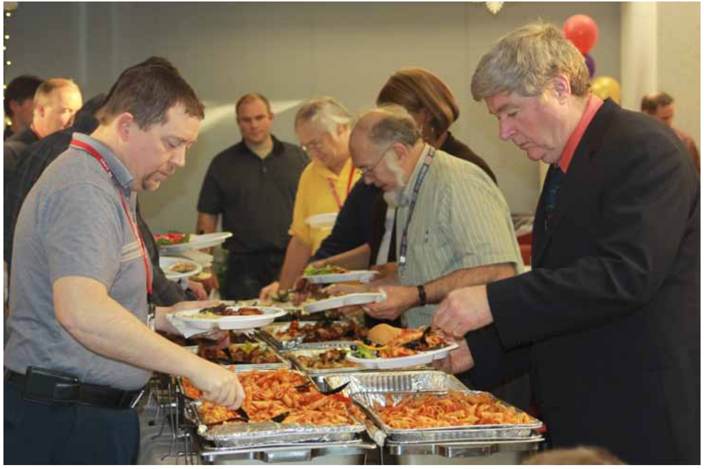
New England District VIPs enjoy a buffet lunch during the holiday party.