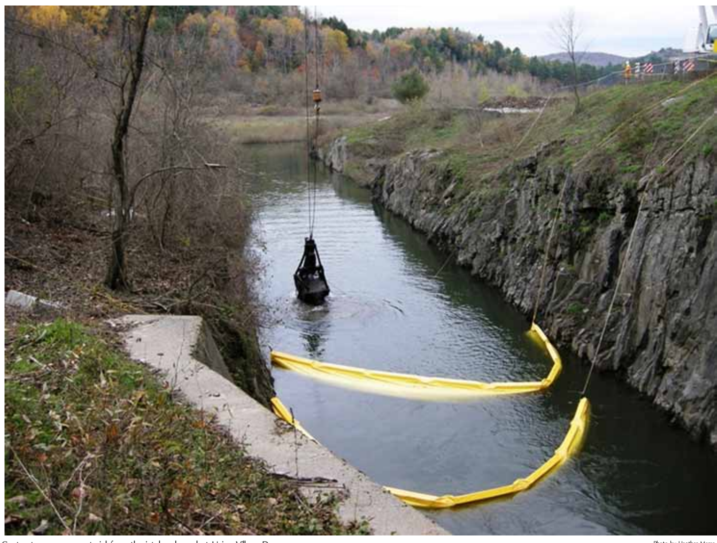
Contractor removes material from the intake channel at Union Village Dam.