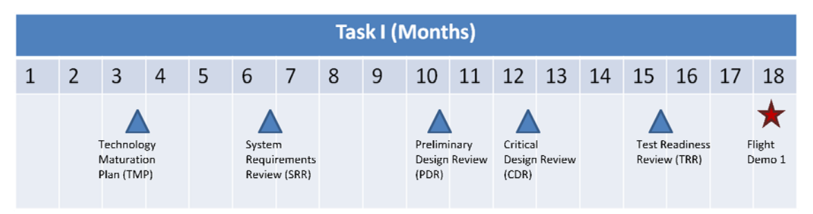
Figure 1: Task 1 Schedule

In their proposals, potential performers should adequately describe the proposed sensor technologies and how they meet the attributes described for the AACUS system, how they will be integrated through the GOAL, and how their capabilities may be enhanced as the program progresses and demonstration scenarios become more challenging. The hardware and software architecture for the GOAL should be discussed including clear identification of software builds/versions (if proposed), the capabilities associated with each build, linkage of these capabilities to program tasking and flight demonstration challenges during each phase. Potential performers should detail autonomous system capabilities and discuss how they meet AACUS system attributes. Proposers should provide a clear flight demonstration philosophy including but not limited to flight demonstration goals for each phase, identification of flight vehicles for each phase, location of flight demonstrations, discussion of flight certification issues, and flight demonstration timeline.