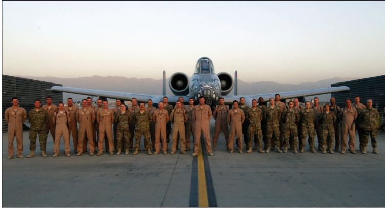
Airmen with the 188th Fighter Wing's 184th Fighter Squadron pose for a photo at Bagram Airfield, Afghanistan, where they were deployed in support of Operation Enduring Freedom. While deployed, the 188th was attached to the 455th Air Expeditionary Wing.