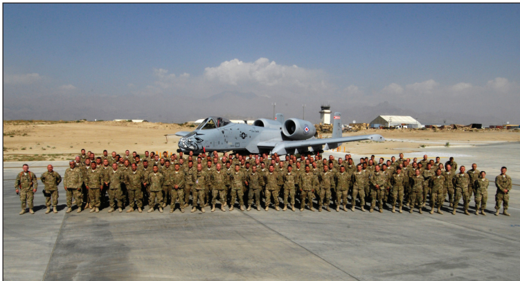
Airmen with the 188th Maintenance Group pose for a photo at Bagram Airfield, Afghanistan, where they were deployed in support of Operation Enduring Freedom. While deployed, the 188th was attached to the 455th Air Expeditionary Wing.