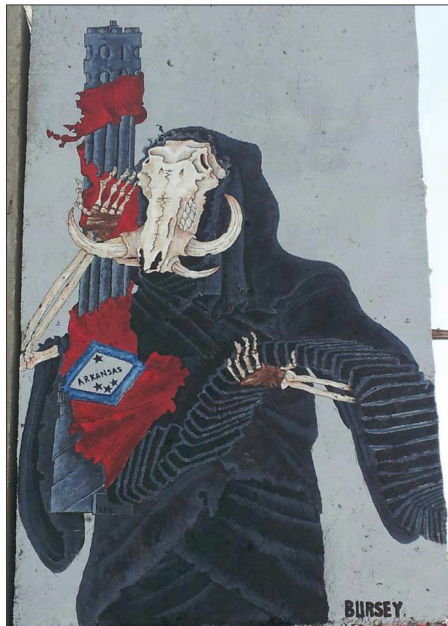
This image is of a mural painted by Staff Sgt. Michael Bursey during a deployment to Afghanistan in support of Operation Enduring Freedom. Bursey painted the mural at Bagram Airfield, Afghanistan. Bursey is one of approximately 375 Airmen with the 188th Fighter Wing currently deployed to Bagram. Notice the figure depicted in the mural is toting a 30mm Gatling gun from the A-10C Thunderbolt II "Warthog."