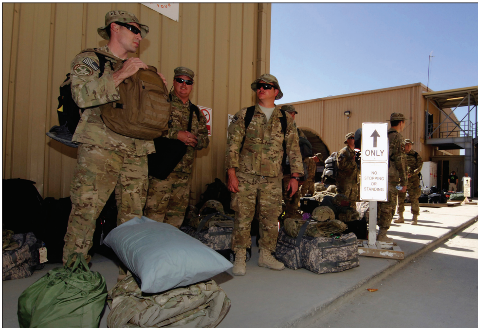
Aircraft maintainers with the 188th Fighter Wing, Arkansas Air National Guard assigned to the 455th Expeditionary Aircraft Maintenance Squadron wait at the passenger terminal for a departing flight for home from Bagram Airfield, Afghanistan, Oct. 3, 2012. The A-10 maintainers from Arkansas and Maryland recently headed home to their respective Air National Guard units.