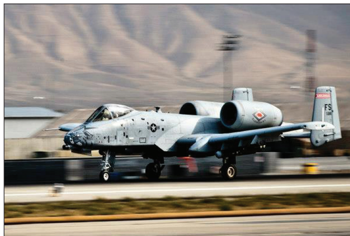
A 188th Fighter Wing A-10C Thunderbolt II "Warthog" takes off at Bagram Airfield, Afghanistan, Sept. 25. Bagram's A-10s fly daily to provide constant close-air support to NATO and Afghan ground forces operating in Afghanistan.