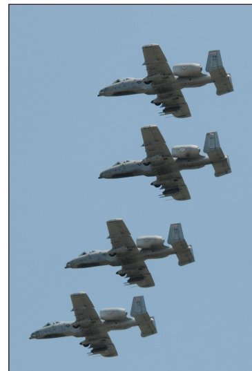
The four-ship passes over the 188th Fighter Wing during their fini flight.