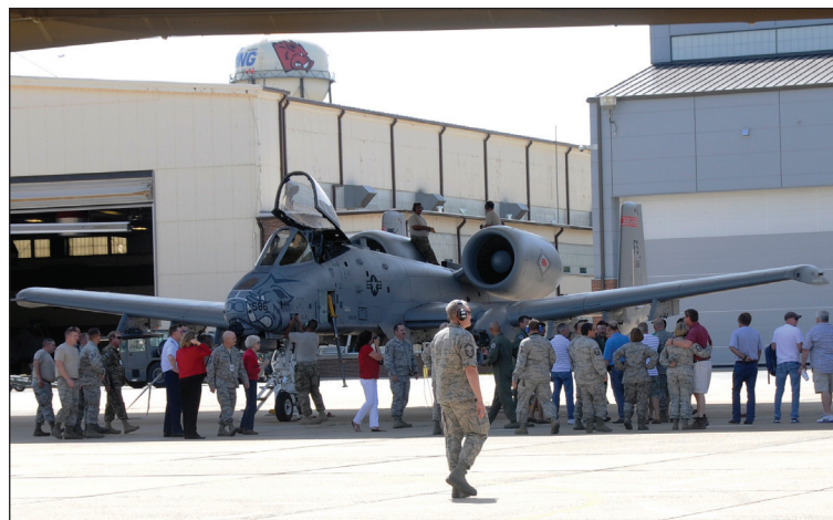
Family, friends and members of the 188th Fighter Wing thank the foursome for their dedication and service, June 12, 2012.