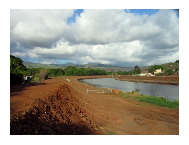
U.S. Army Corps of Engineers, Honolulu District

MSC Approval Date: 6 December 2012 Last Revision Date: 29 November 2012