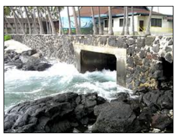
Keōpū Stream

MSC Approval Date: 6 December 2012 Last Revision Date: 19 November 2012