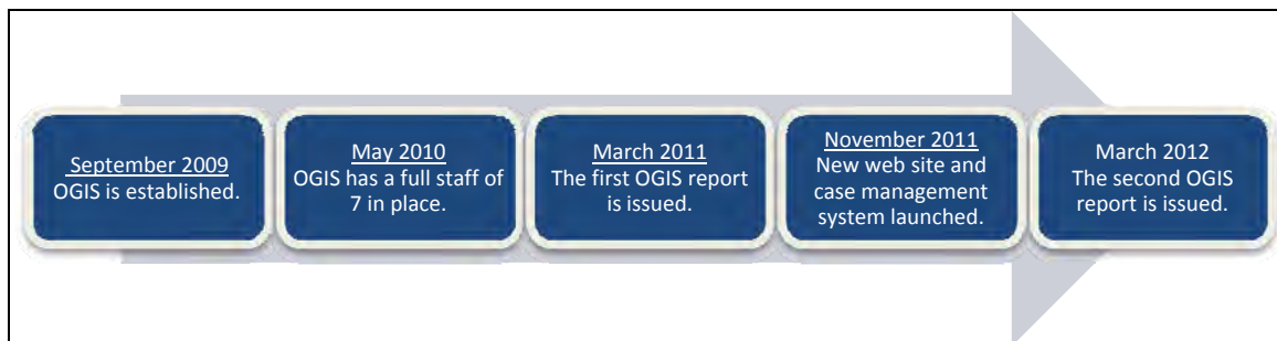
Figure 1: Timeline of OGIS's Establishment and Milestones

OGIS is responsible for working with executive branch agencies and requesters to improve the administration of FOIA. Pursuant to 5 U.S.C. § 552(h), OGIS is charged with: