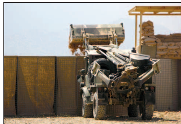
A dump truck unloads dirt into the newly assembled barriers to reinforce the fortifications at Forward Operating Base Lonestar. Transporting the heavy equipment in convoys over the rough terrain is the biggest challenge for the Soldiers working on the newly built FOBs.

The FOB overlooks the foothills of the Tora Bora Mountains where Taliban combatants are known to move through from