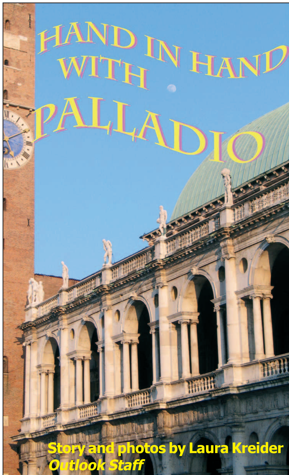
(Above) Detail of Palladio's Basilica in downtown Vicenza. The architect started his project in 1549, but it was completed only after his death in 1614. (Below) View of Palazzo Chiericati, one of the creations of Palladio. He worked there from 1550 to 1557. It is included in the Saturday tour.