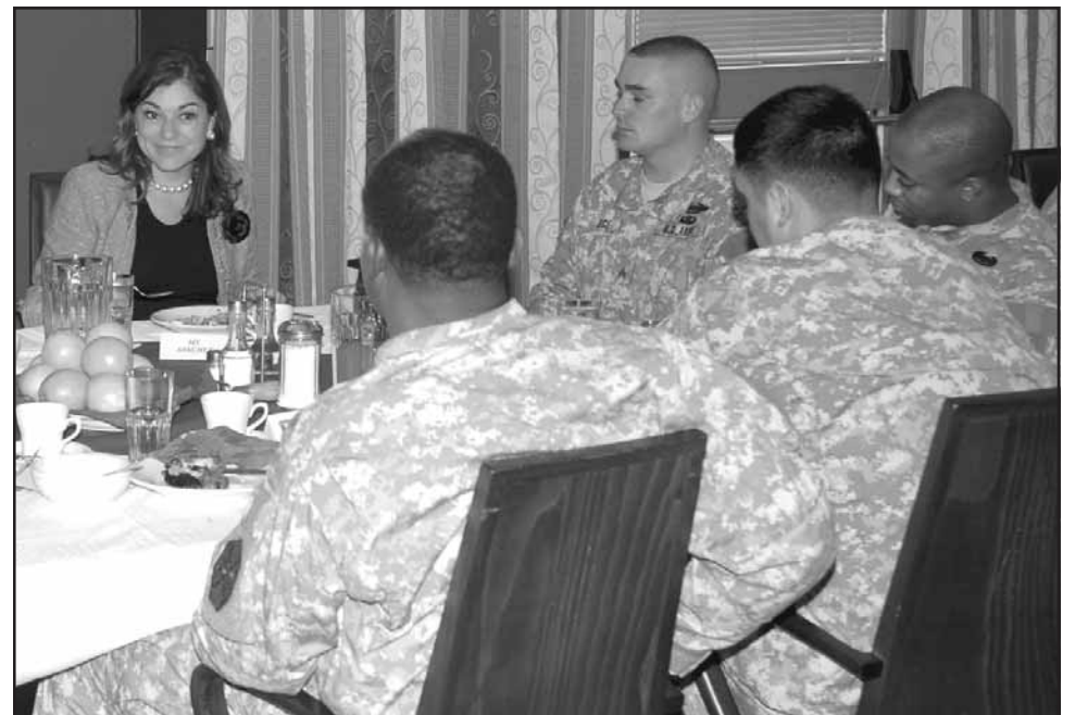
Congresswoman Loretta Sanchez (D-CA), shared lunch and thoughts about military life with Soldiers during a visit to Caserma Ederle Nov. 30. Sanchez was joined on this trip by Rep. Bill Young (R-FL), and Rep. Kay Granger (R-TX). The representatives met with key leaders in the Caserma Ederle community and were given an update on the SETAF and Brigade missions.