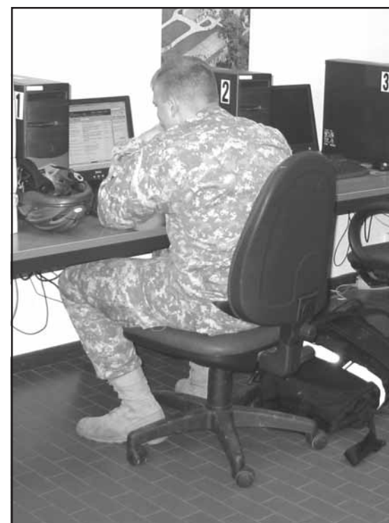
This Soldier is taking advantage of a computer in the USAG Vicenza Education Center's Learning Center.

The USAG Vicenza Education Center has counselors available to assist members of the community (local and remote) with academic advising, financial aid and other college related issues.