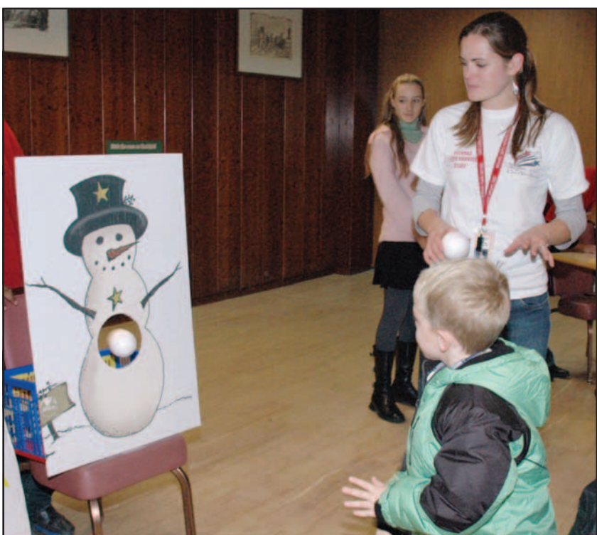
Above: Children have fun with Frosty the Snowman Snowball Toss activity at the 'Seeing is Believing' event held in Club Veneto Thursday.