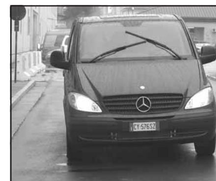
Winter is here and Caserma Ederle has an inclement weather plan in place for work and school.

Parents can get information on student locations by contacting the School Transportation office at 0444-71-8132 or the SEOC at 0444-71-7520/7720.