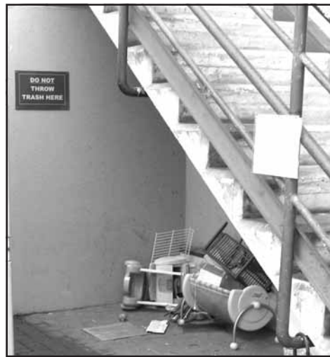
Above: Even though there is a sign that clearly states not to leave trash here, someone dumped items underneath the stairs by the Thrift Shop. Left: This cart was left sitting in front of these barracks.

Honor the hours and operation of the Thrift Shop when donating. The back door is not a place for you to dump your junk at midnight. The garrison is constantly picking up behind folks who dump furniture and other items at the rear door. This is totally unacceptable and it destroys our image as a community. Keep your items until there is space in the bins, or when the store is open and can be processed by the volunteers immediately. We need your donations but not wet soggy ruined items that have spent the weekend or night in the rain and cause more work for others.