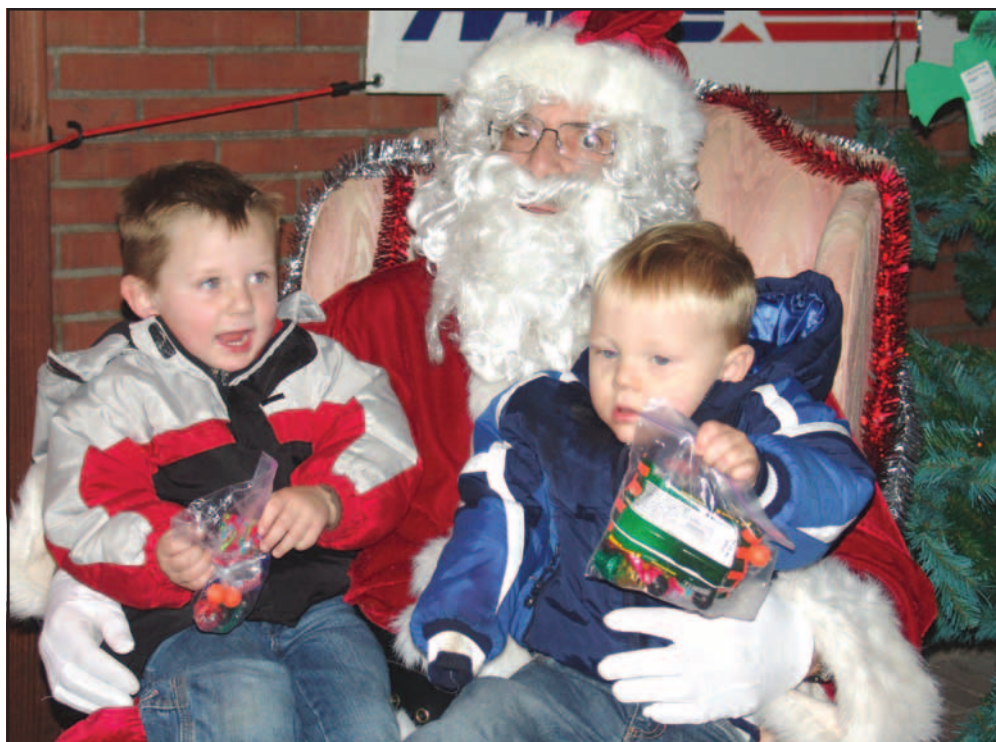
Above: A little boy tells Santa what he wants for Christmas while his brother listens attentively. The children visited with Santa at Camp Darby's Annual Tree Lighting Ceremony Dec. 1.