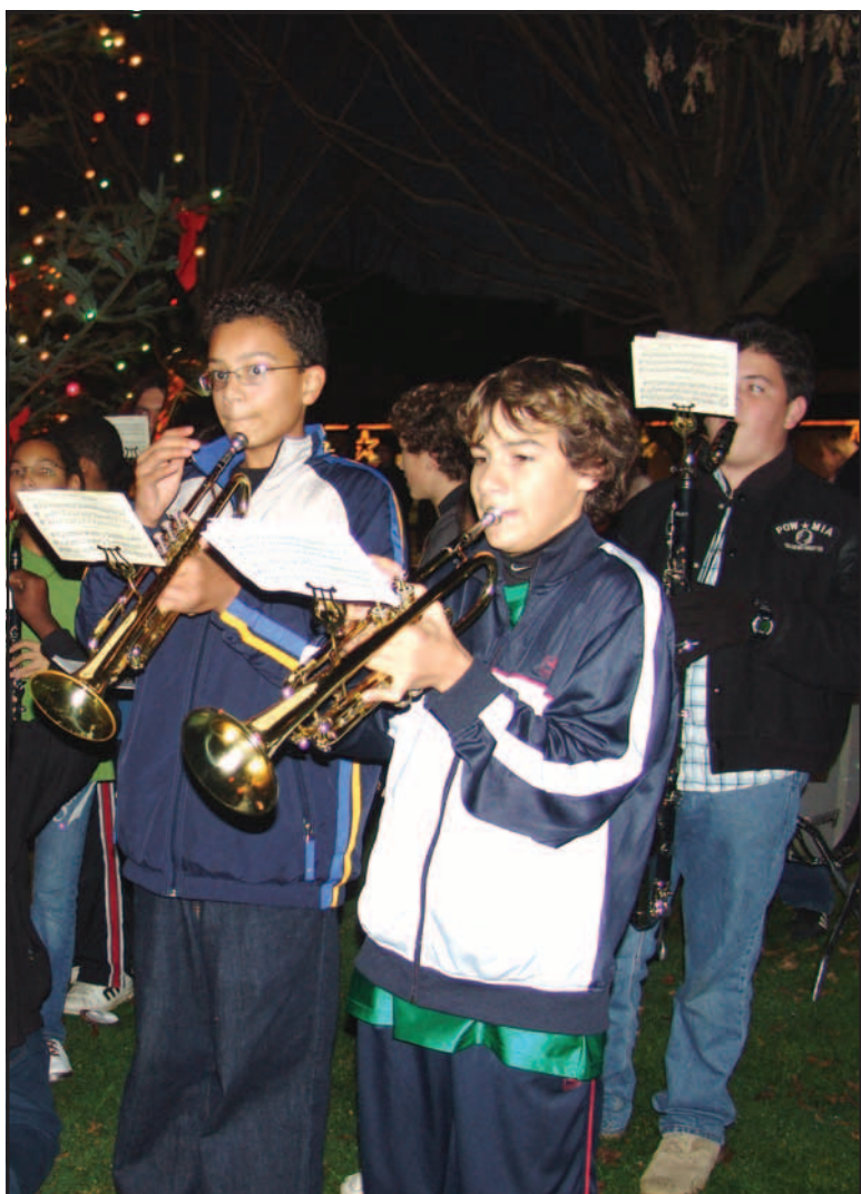
The Livorno Unit School Band plays holiday carols for the Camp Darby Community and the President of Pistoia at the annual Community Tree Lighting ceremony Dec. 1.