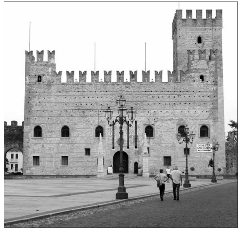
The Castello Inferiore in Marostica, site of the September market.

The cost is 35 euro per person and reservations can be made starting Aug. 27 in Palazzo Trissino, which is open Monday-Saturday from 10 a.m.-12:30 p.m., on Tuesdays and Thursdays also open from 3-5:30 p.m.