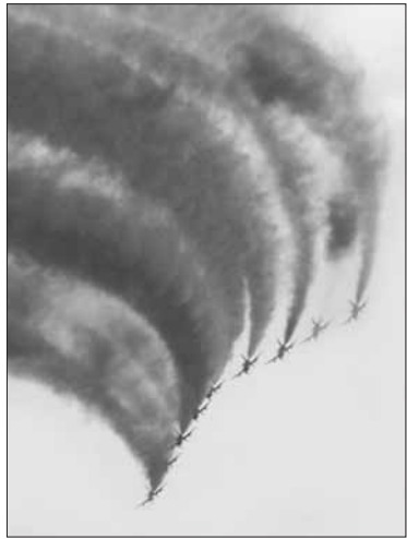
Frece Tricolori in flight.