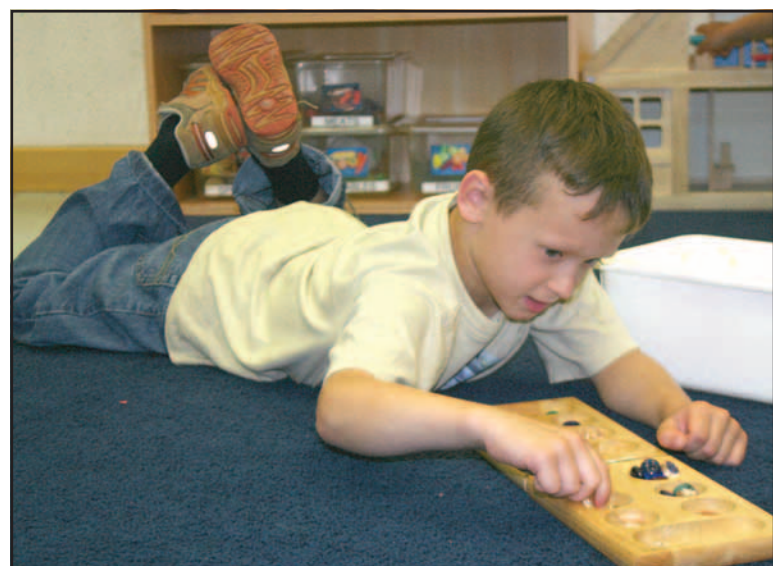
SAS2: A boy plays a round of Mancala at U.S. Army Garrison Schweinfurt’s School Age Services. The garrison’s Blue Star program offers discounts for child care for deployed Soldiers. During a Soldier’s deployment, CYS provides a 20 percent discount on regularly scheduled full- or part-time child care; free participation in two sports per child per year; and free tuition in four eight-week sessions of SKIES. Plus, the annual registration fee is waived.