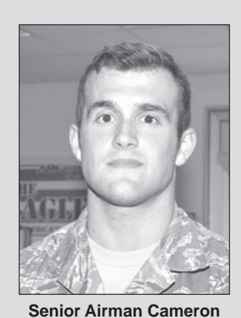
Currie AFN Vicenza "Get out with family and friends and take advantage of the culture, seeing the sights and enjoy the activities."