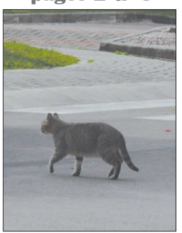
EFMP respite care enhancing quality of life; Stray cat population on Villaggio being handled