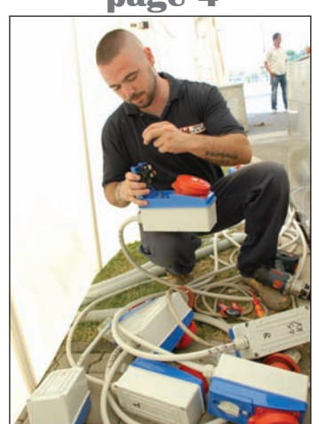
Behind the scenes of festival setups