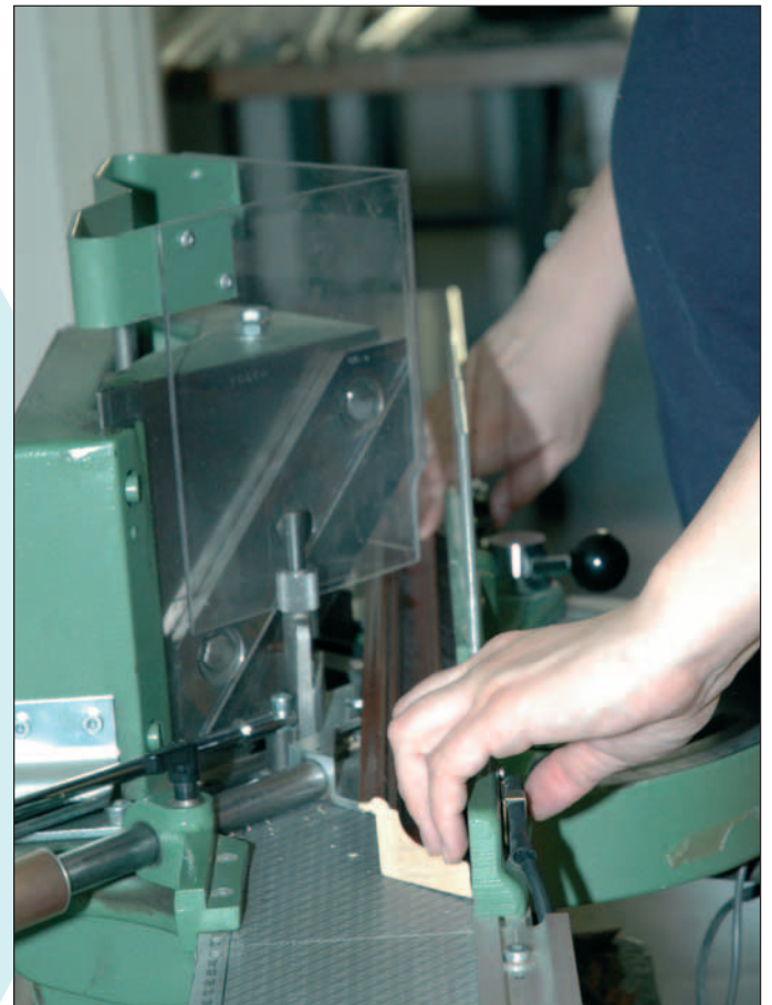
Above: A participant in the Intro to Picture Framing works at the frame cutter. Left: Children participate in one of the birthday parties held at the Art Center. Up to 10 children can create a special art project of their choice. The cost, which includes materials varies between $70 to $90.