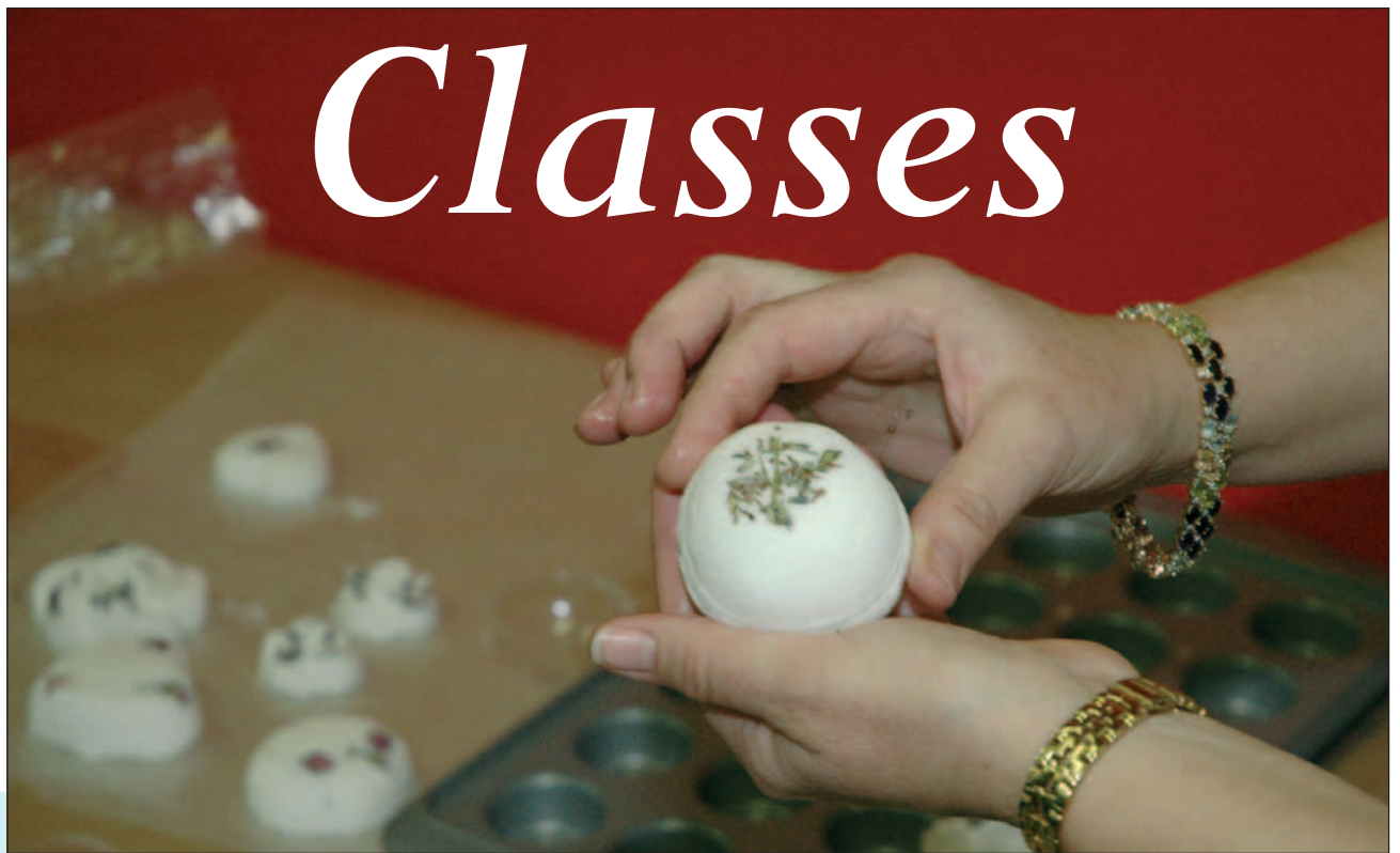
Above: Women attending the Bath and Body class at the Vicenza Art Center smell one of the scented bath balls. The class held at the center at the beginning of February focused on how to make natural bath bombs and lip balm. "The class is not only interesting but fun," said one of the participants. The next Bath and Body class is scheduled for Feb. 27 from 10:30-12:30.

For more information about upcoming classes and registration, call the center at 634- 7074.