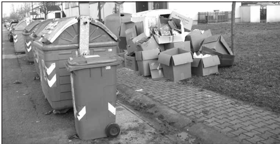
After you've unpacked from the move, call the Installation Transportation Office at 634-6926 to have the movers return to pick up the boxes. Otherwise, break down boxes so they'll fit into the recycling bins.