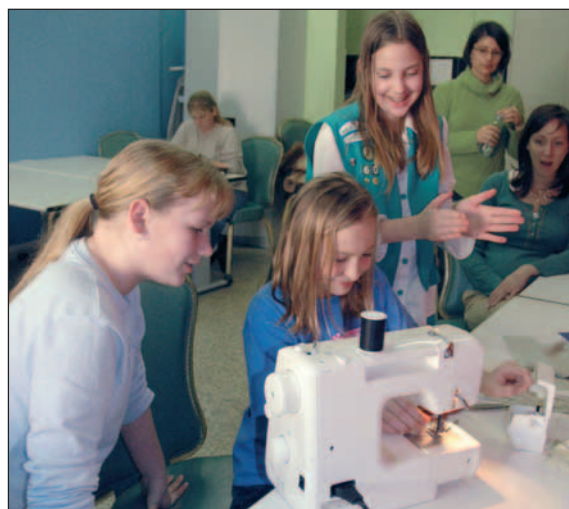
Girl Scout Troop 60 participants learn how to use a sewing machine in the Back to Basics of Sewing Class taught at the Art Center Feb. 13.