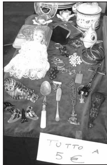
You never know what treasures you'll find at an area market.

Piazzola sul Brenta : Located in the province of Padova the last Sunday of the month with 600 vendors.