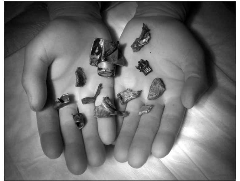
A member of the forward surgical team displays items removed from patients during surgery at the aid station. Among them: shrapnel, a bullet and a rock. The large item in the center is a component of a rocket propelled grenade. The team called explosive ordnance disposal in to determine whether or not it posed a threat.

Medical care here runs the gamut from IED blasts to gunshot wounds, shrapnel, burns and