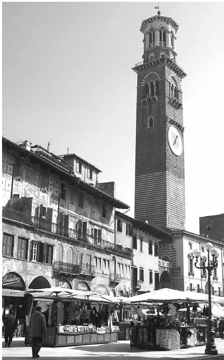
View of Piazza delle Erbe, a square in downtown Verona. Renowned for its market, the square was the site of the Roman Forum during the Roman Empire. The tower in the picture is Torre dei Lamberti.

The city was, at one time, the capital of Italy's movie-making industry until the 1930s, when dictator Benito Mussolini moved all film production to Rome after he created Cinecittà, the Italian