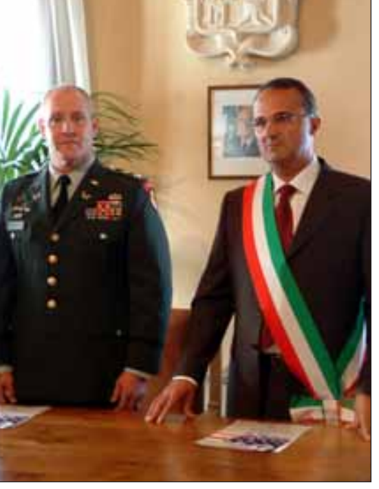
Grisignano Press Office